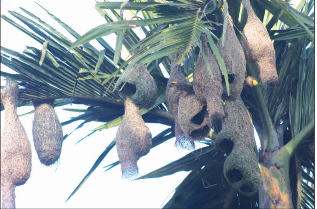
Several Tukura Sorai nests seen beautifully hanging from a tree in Majuli on Sunday.