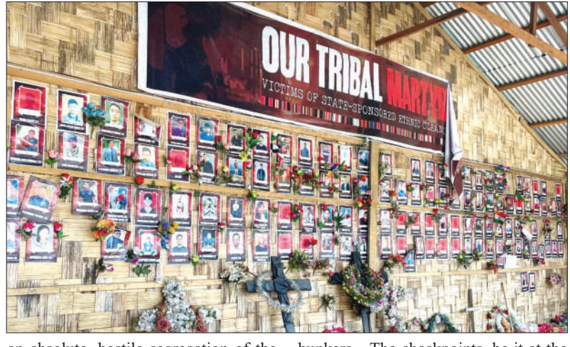
An absolute, hostile segregation of the communities. Until last May. Now, the Meiteis population is concentrated in Imphal Valley and the Kukis have shifted to the hills. Nothing illustrates the state's deep ethnic fault lines better than the bordering areas dividing the plain and hill districts. Converting coils, armoured vehicles, armed security personnel, sandbag bunkers... The checkpoints, be it at the border between Bishnupur and Kuki dominated Churachandpur, or Meitei controlled Imphal West and Kuki 'area' Kangpokpi, almost resemble boundaries between hostile nations. The conflict has segregated not just civil society but also police personnel and government officials. "The state has gone back at least by two decades," (CONTD. ON PAGE-2)

IMPHAL/CHURACHANDPUR (MANIPUR), May 3: Manipur is a state divided and society was pulled apart, separating families and neighbours who had lived together for generations and upending thousands of lives. It was exactly a year ago. May 3, 2023. The date is imprinted on the collective memory of an entire people who mark the day two Manipurs came into being, divided as it were by a virtual line of control. That was the day a 'Tribal Solidarity March' organised in the hill districts to protest against the Meitei community's demand for Scheduled Tribe (ST) status led to ethnic clashes between the Meitei and the Kuki communities. The conflict, which has impacted everyday life in myriad ways, has claimed more than 200 lives and displaced many thousands. The three main ethnic groups in the northeast state have historically clustered in different parts of the state's geography - the Meiteis in the valley, the Kukis in the southern hills and the Nagas in the northern hills. But there has never been