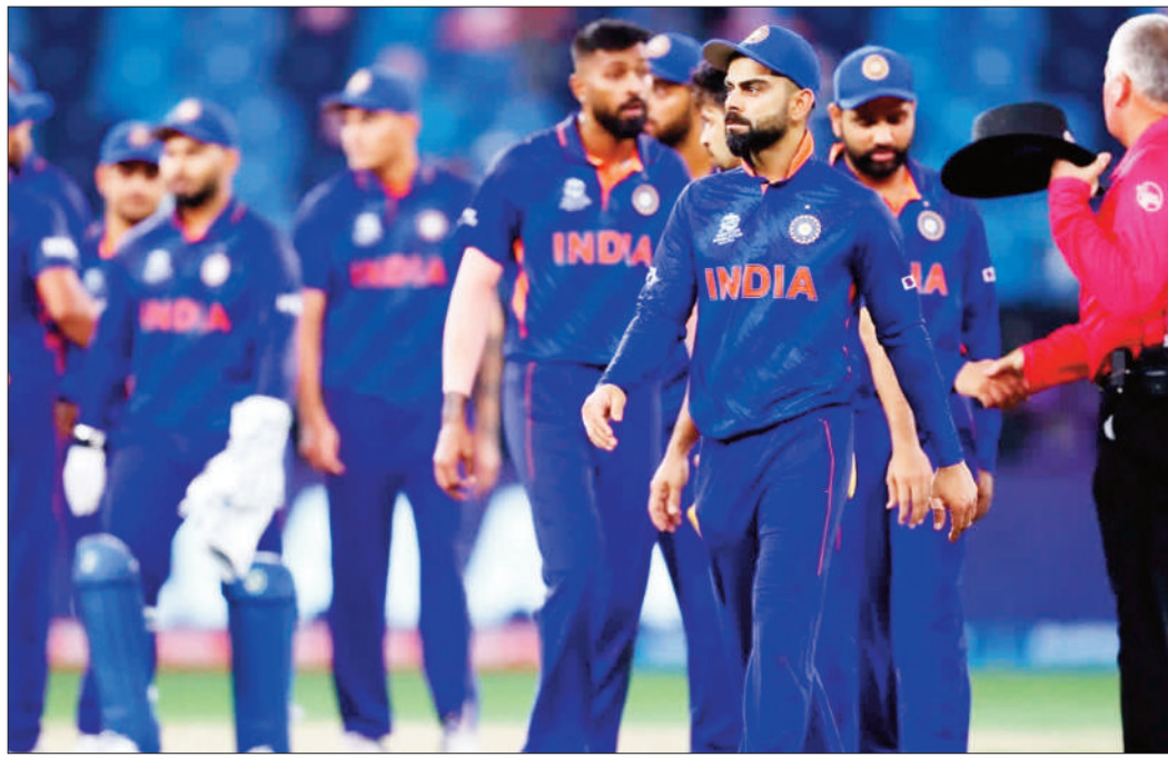
Teams need to play a minimum of eight Tests over a three-year period to get on the rankings table.

The order of teams ranked from third to ninth remains the same. Only nine teams are now ranked as Afghanistan and Ireland have yet to play sufficient Tests, while Zimbabwe too are out as they have played only three Tests over the past three years.