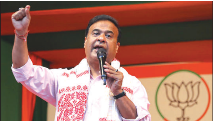
Himanta Biswa Sarma speaking at a podium.

GUWAHATI, May 3: Assam chief minister Himanta Biswa Sarma on Friday claimed that Congress leader Rahul Gandhi will win in Pakistan if elections are held there but in India, victory will be of Prime Minister Narendra Modi. Sarma had lashed out at Rahul Gandhi and his sister Priyanka Gandhi Vadra on Thursday as well, calling them "irrelevant" in Assam and "past the expiry date".