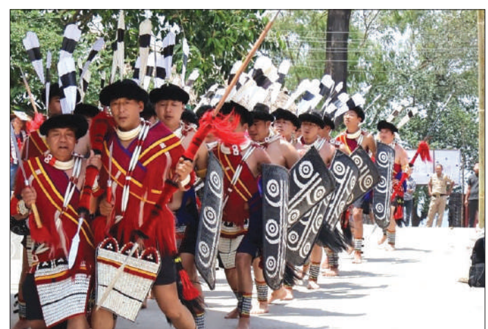
exhibit our cultural traits so as to ensure that our unique culture and traditions are not lost," he said.