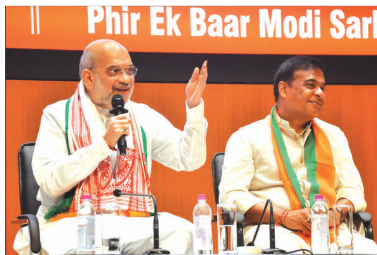
they gave reservations to Muslims in undivided Andhra Pradesh and for this, the OBCs were affected. Without conducting any survey, they put all Muslims in Karnataka in the OBC category and reserved a 4 per cent quota for the

It is the Congress that has deprived the SC, ST and OBCs of their rights as