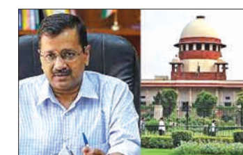
the Tihar jail here under judicial custody after his arrest on March 21 in the case. The top court issued ED a notice on April 15 and sought its response to Kejriwal's plea.

On April 9, the high court upheld Kejriwal's arrest, saying there was no illegality and the ED was left with "little option" after he skipped repeated summonses and refused to join the investigation.