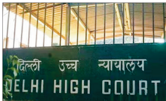
the interest of Waqf properties.