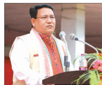
non-Bodo communities, the results of which would be reflected in support for his party in the elections.