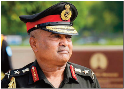
NEW DELHI, April 30: Warfare has transcended into new domains, such as space, cyber, electromagnetic spectrum and information systems, and India must develop indigenous capabilities to deal with future security challenges, Army Chief Gen Manoj Pande said on Tuesday.

The Army chief especially underlined the importance of "technology infusion" and "self-reliance" in the armed forces, saying both are distinct yet interconnected.