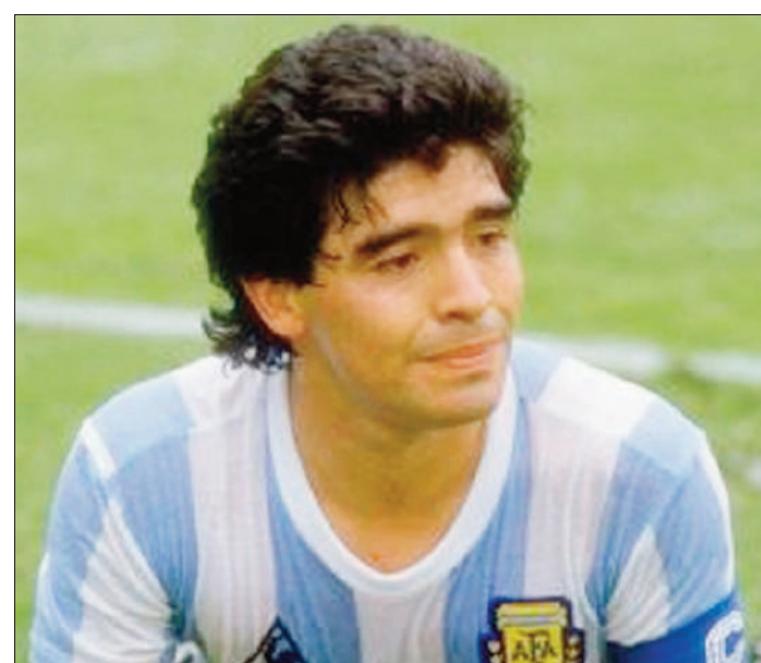
devastated a generation of soccer fans and sent all of Argentina into mourning. Within days, the country became consumed by questions about his final, perplexing hours, a frenzy of suspicion that intensified as police officers raided his doctors' homes and offices and

Maradona's family pressed the judiciary to intervene.