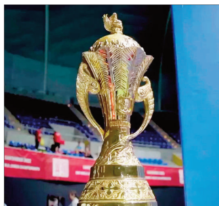
Centre of Excellence is a state-of-the-art facility for badminton and will be the perfect arena for our next generation talent to battle it

out for team and individual glory." Dates for the 2025 event are yet to be confirmed.