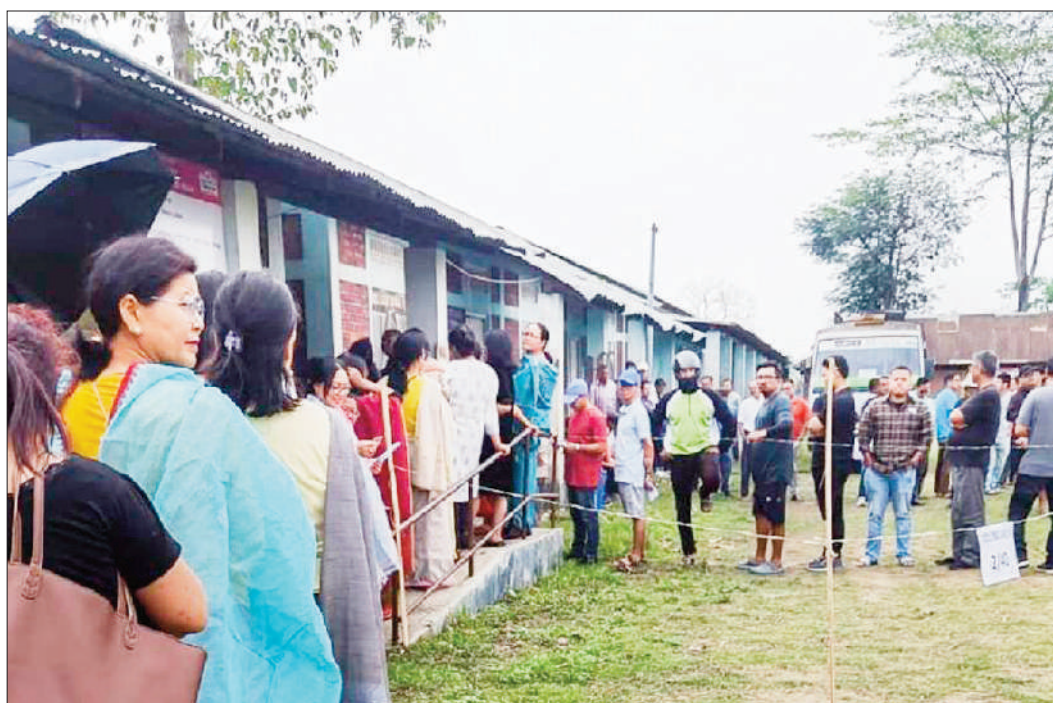
IMPHAL, April 30: A voter turnout of 81.16 per cent was recorded at six polling stations in Outer Manipur Lok Sabha seat,

where repolling was held on Tuesday, election officials said. No untoward incident was reported and voting, which com-