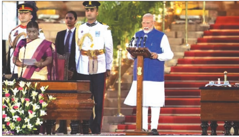
Cabinet ministers -- JD(S) leader H D Kumaraswamy, HAM (Secular) chief Jitan Ram Manjhi, JD(U) leader Rajiv Ranjan Singh 'Lalan', TDP's K Ram Mohan Naidu and LJP-RV leader Chirag Paswan. Each of these five allies got one cabinet berth each. Kumaraswamy and Manjhi are former chief

In the recently concluded Lok Sabha elections, the BJP failed to win a simple majority, making it dependent on allies whose MPs also took the oath of office as