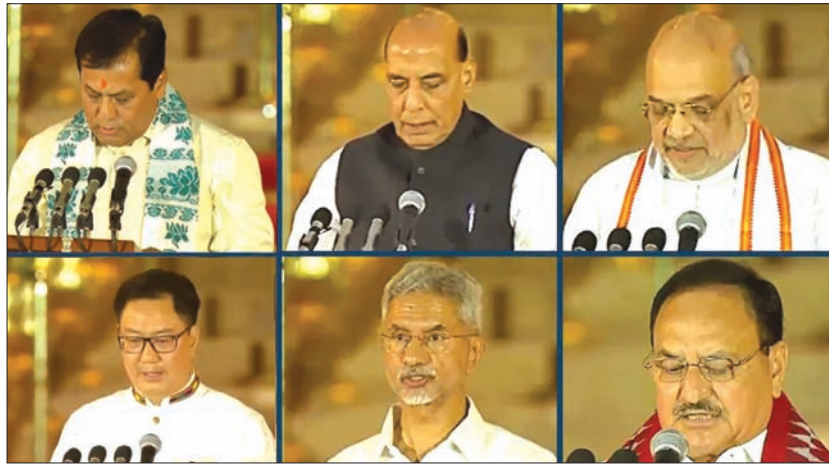
ministers of Karnataka and Bihar respectively. BJP Party president J P Nadda returned to the cabinet after five years, while former Madhya Pradesh chief minister Shivraj Singh Chouhan and ex-Haryana CM Manohar Lal Khattar were the fresh faces in the Modi cabinet. BJP leaders Piyush Goyal, Jyotiraditya Scindia, Dharmendra Pradhan and Bhupender Yadav, who were earlier in the Rajya Sabha but have now been elected to the Lok Sabha, were among those retained as ministers. Former Assam CM Sarbananda

sworn in as Cabinet ministers. Congress president and Leader of Opposition in Rajya Sabha Mallikarjun Kharge was present, even as several opposition leaders skipped the ceremony.