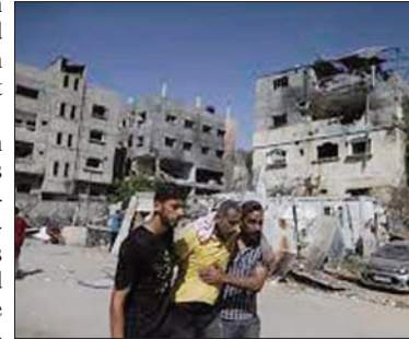
250. Israel's war against Hamas in Gaza has killed more than 36,730 people, according to Gaza's Health Ministry, which does not distinguish between combatants and civilians in its count. Palestinians are facing widespread hunger because the war has largely cut off the flow of food, medicine and other supplies. U.N. agencies say over 1 million in Gaza could experience the highest level of starvation by mid-July.