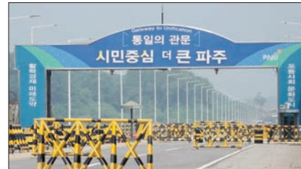
Chiefs of Staff said. Those North Korean soldiers carrying construction tools — some of them armed — immediately returned to their territory after South Korea's military fired warning shots and issued warning broadcasts, the Joint Chiefs of Staff said. It said North Korea had not conducted any other suspicious activities.

SEOUL, June 11: South Korean soldiers fired warning shots after North Korean troops briefly violated the tense border earlier this week, South Korea's military said on Tuesday, as the rivals are embroiled in Cold War-style campaigns like balloon launches and propaganda broadcasts. Bloodshed and violent confrontations have occasionally occurred at the Korea's heavily fortified border, called the Demilitarized Zone.