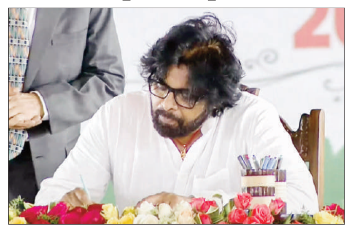
AMARAVATI (ANDHRA PRADESH), June 14: The Andhra Pradesh government on Friday designated Janasena chief Pawan Kalyan as Deputy Chief Minister.

The actor-turned-politician has been allotted Panchayat Raj and Rural Development, Environment, Forests, and Science and Technology portfolios. Rural Water Supply department would also be handled by Kalyan.