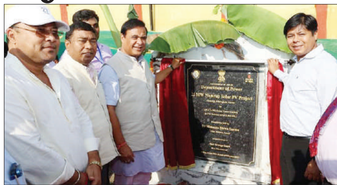
A joint venture collaboration between the Assam Power Generation Corporation and Oil India Limited, the project will be spread across 108 acres of land and is likely to cost ₹ 115 crore in project cost. The solar project, approved by the state cabinet on August 19, 2022, is projected to produce 50

HT Bureau GUWAHATI, June 14: The construction of a 1,000-mw capacity solar power plant in Karbi Anglong will begin shortly. Informing this today, Chief Minister Himanta Biswa Sarma said "The 120-Mw Lower Kapili Hydropower project, on the other hand, has started yielding electricity. The state will be able to produce around 3,000-Mw of solar generated electricity by 2030." Sarma said this in a public meeting after laying the foundation stone for a 25-Mw capacity solar power generation project at the premises of the Namrup Thermal Power Station in Dibrugarh district.