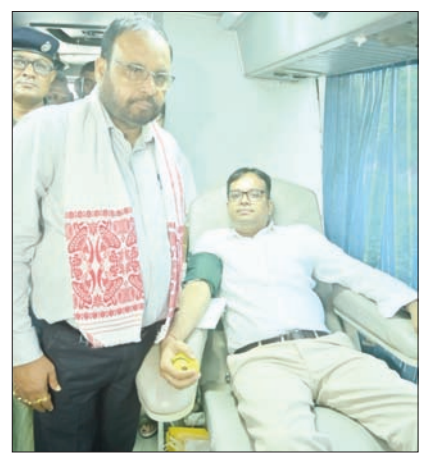
blood and even we help the patients of the private hospitals to get blood. There are 83 blood banks in Assam and 7 more blood banks will be established soon," he said. Mahanta further (CONTD. ON PAGE-2)

HT Bureau GUWAHATI, June 14: The Assam State Blood Transfusion Council (ASBTC) joined the global community in observing World Blood Donor Day on June 14, 2024, at the Sri Sri Madhabdeva International Auditorium, Kalakshetra, Guwahati. The theme for World Blood Donor Day 2024 is "20 years of celebrating giving: Thank you, blood donors!" Addressing the gathering as the chief guest, Minister for Health & Family Welfare, Keshab Mahanta, expressed gratitude to blood donors for their invaluable contribution to saving lives. "The 20th anniversary of World Blood Donor Day is an excellent and timely opportunity to thank blood donors for saving precious lives through blood donation and this day provides us an opportunity to honour the donors who have been helping in saving lives. Through blood donation we have been able to help people who need