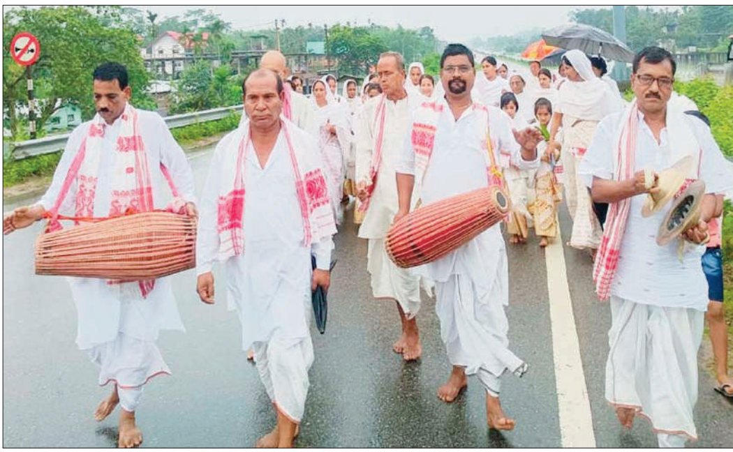
Devotees taking out a water collection on the occasion of annual Bor Sabha Bornamghar at Tongana Village, Gohpur on Monday.