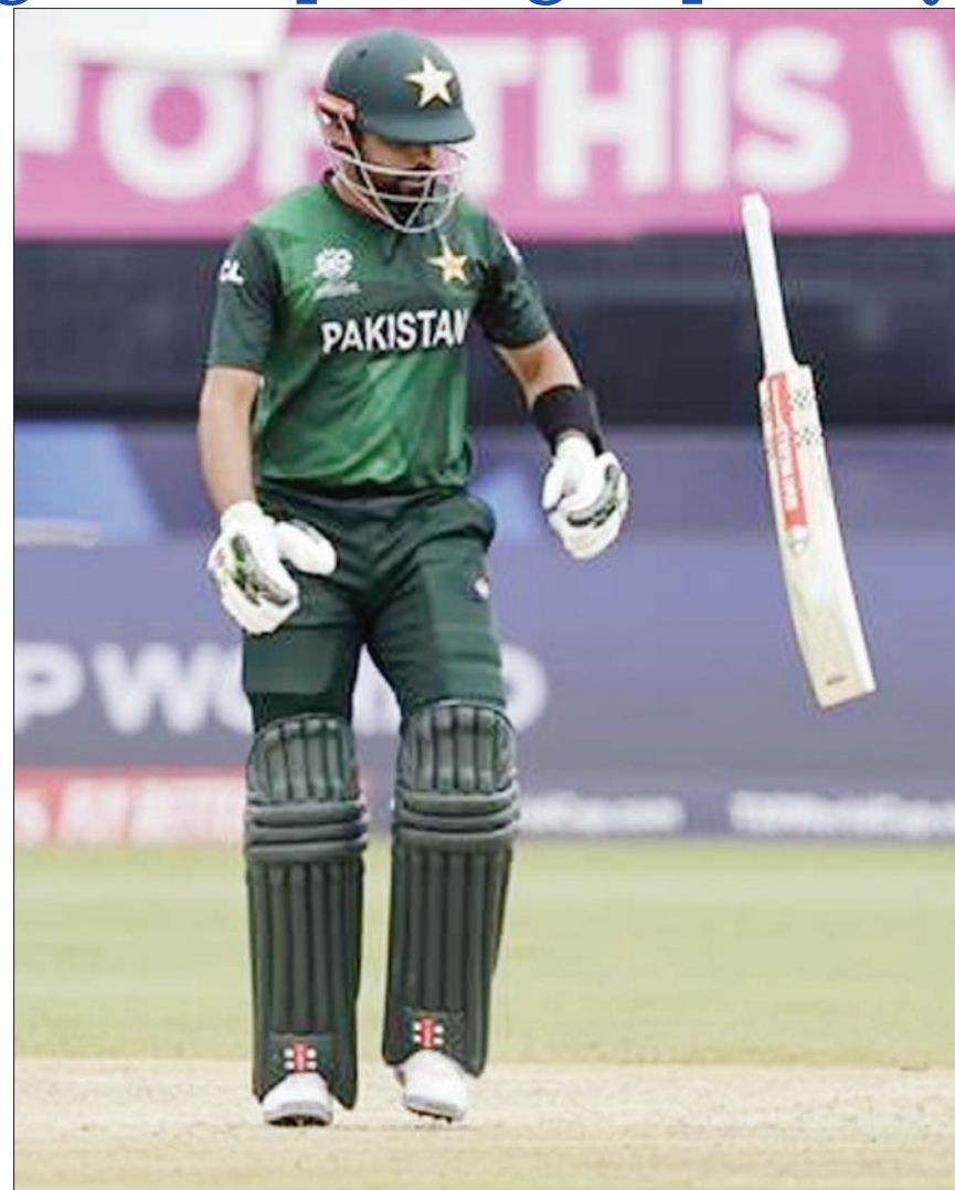
this because of one person. You are pointing out that because of the captain, I cannot play in every player's place. There are 11 players and each of them has a role.

"We are losing as a team. I am not saying