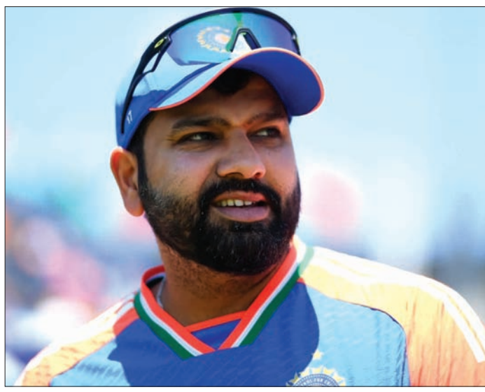
Rohit said after the match.

"New venue, new ground, drop-in pitch - important to get used to it and we managed pretty well,"