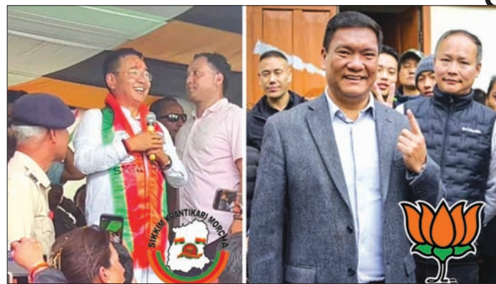
(3) and PPA (2). Three seats went to Independent candidates. Chief Minister Pema Khandu asserted that the momentum of what happened in the 'Land of the rising sun', a sobriquet for Arunachal Pradesh, will spread to other parts of the country on June 4 when votes for the Lok Sabha elections will be counted. "This is a historic occasion for the BJP and entire Arunachal Pradesh. The people of Arunachal Pradesh have declared that they

HT Bureau GUWAHATI, June 2: The Bharatiya Janata Party (BJP) on Sunday retained in Arunachal Pradesh, while the ruling Sikkim Krantikari Morcha (SKM) secured a second term in Sikkim. Voting was held for 60 assembly seats in Arunachal Pradesh and 32 assembly seats in Sikkim on April 19. The saffron party returned to power in Arunachal Pradesh for the third time in a row after winning 46 seats in the 60-member assembly, and bagging four more seats compared to its 2019 tally. In sweeping the assembly elections, the counting of which was held during the day, the BJP decimated the opposition parties, especially the Congress which was relegated to the fifth position with only one seat after NPP (5), NCP