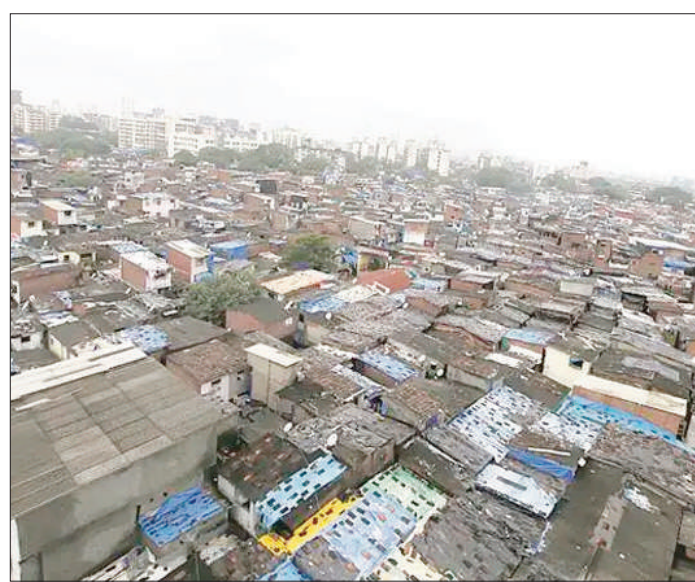
for its slums on private and public lands," the HC said.

"In our opinion, the acquisition in the present case is totally unwarranted. The decision of the SRA, as