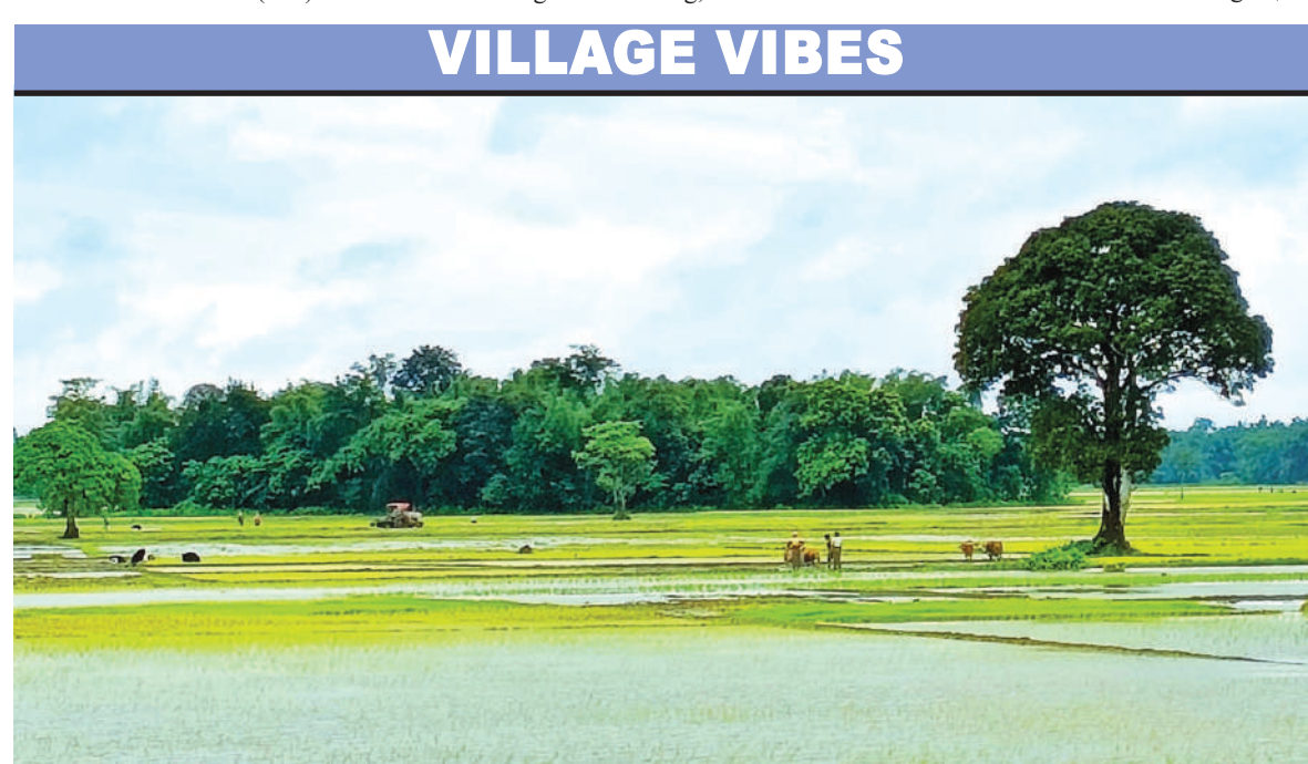
A farmer busy in a Paddy field in Dhakuakhana on Wednesday.

"They (PM and Shah) thought that just because they have political power, they have ED, CBI and the Income Tax department, they can dictate to people what is going to happen. (CONTD. ON PAGE-2)