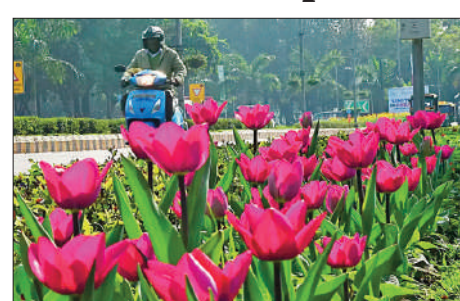
NEW DELHI, June 12: Delhi will be adorned with over nine lakh tulips during the flowering season, Raj Niwas officials said on Wednesday.

Nine lakh tulips will be planted this year, almost double the number of tulips planted in Delhi in the winters of 2023 (five lakh) and almost six times the number planted in 2022 (1.5 lakh tulips), they added.