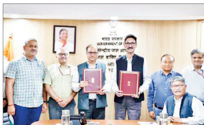
aligning with government objectives.

These efforts aim to improve water management practices and boost agricultural productivity,