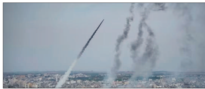
Hezbollah fired a massive barrage of rockets into northern Israel on Wednesday to avenge the killing of a top commander, further escalating regional tensions as the fate of an internationally-backed plan for a cease-fire in Gaza hung in the balance.

US President Joe Biden's administration has said the best way to calm regional tensions is for Hamas to accept a proposal for a phased cease-fire that it says would end of the war in Gaza and bring about the release of the remaining hostages abducted in Hamas' October 7 attack that ignited the war. The UN Security Council voted overwhelmingly in favour of the