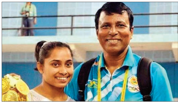
ment of gymnastics.

He lauded the state government for providing good facilities at the Netaji Subhash Regional Coaching Centre (NSRCC) here for develop-