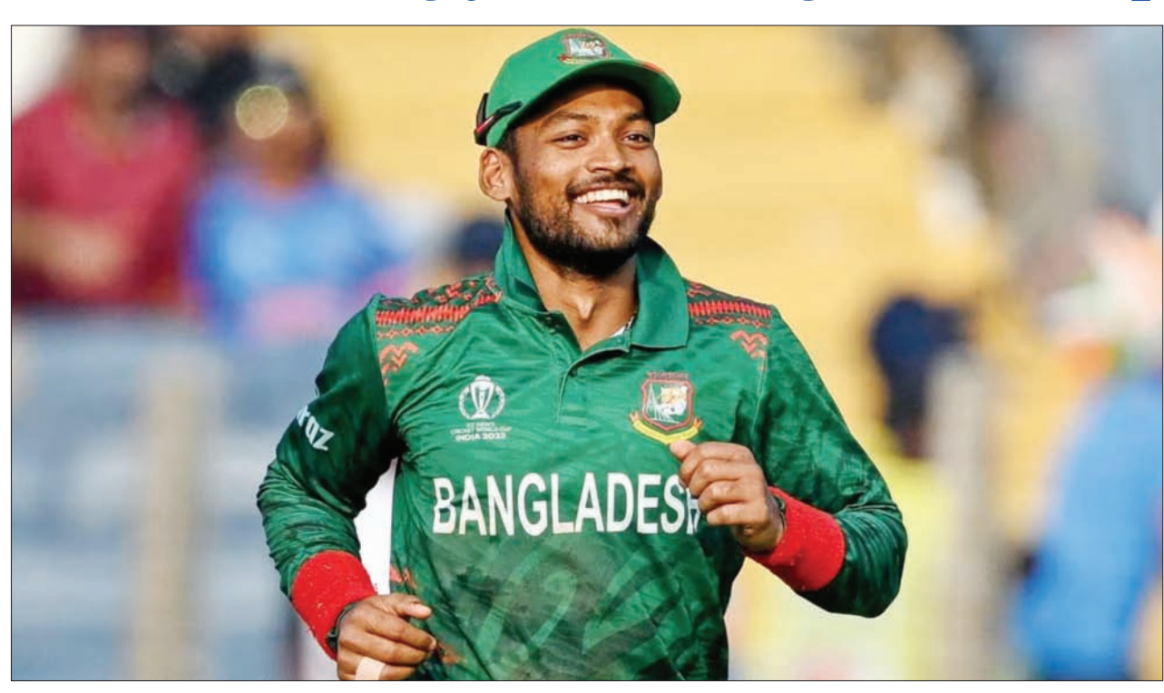
batsmen also have a responsibility. And why it is not happening, everyone is trying to find out. But it is not happening anyway,

"I hope they (the bowlers) make us win every day; that's what I hope for, but the