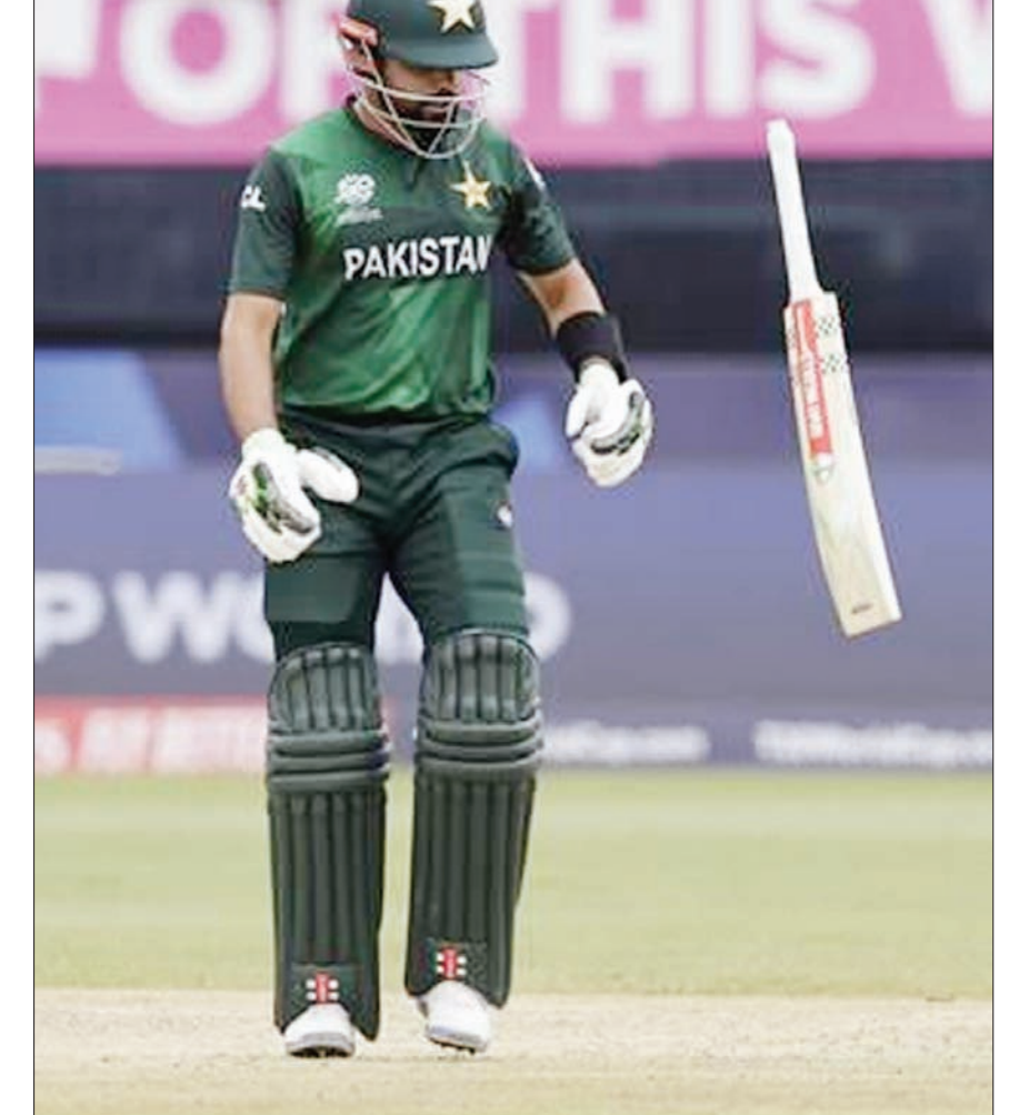
out that because of the captain, I cannot play

cause of one person," he told a probing "We are losing as a team. I am not saying