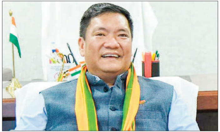
to implement these initiatives in letter and spirit. The state cabinet set a 100-day road map to undertake develop-

Laying the foundation for building a developed Arunachal for the next five years, the cabinet rolled out 'Reforms 3.0', identifying 24 citizen-centric initiatives as part of the transformative journey, touching citizens lives and aspirations, and directed all departments