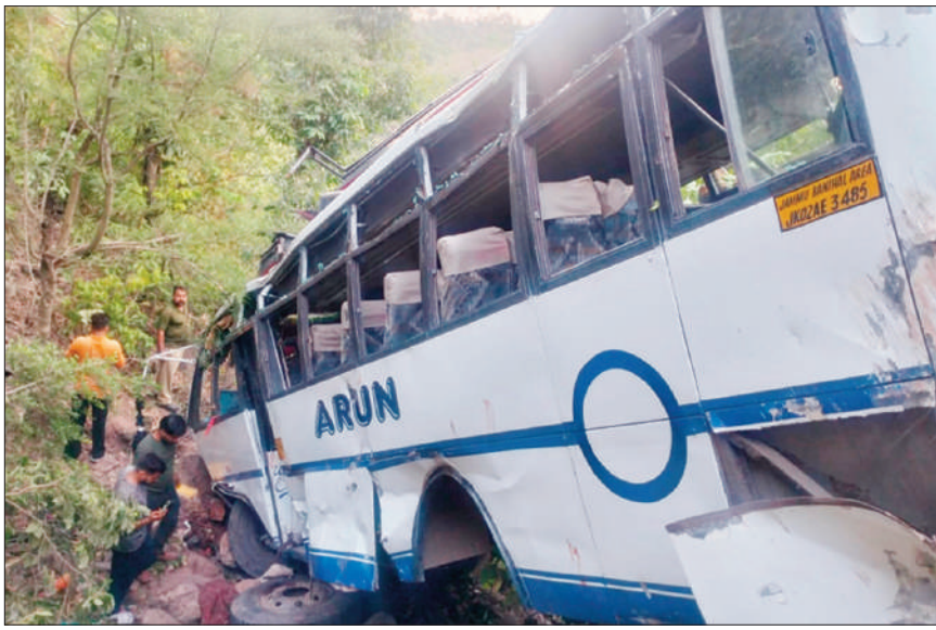
retracted its statement later.

The Resistance Front (TRF), a shadow group of the banned Lashkar-e-Taiba terror outfit, initially claimed responsibility for the attack but