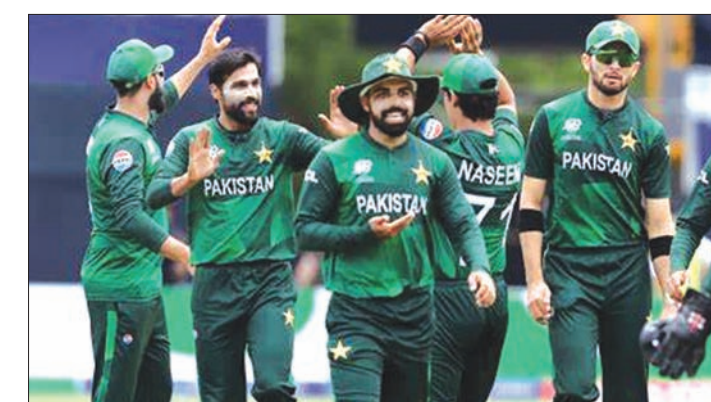
what is a captain supposed to do when your premier bowler can't even defend 15 in the final over against a weak USA side and concedes a boundary and six on full tosses.

"The return of Imad and Amir added to the confusion as it was difficult for Babar to get any worthwhile performances from both of them as they had not played top level domestic or international cricket for a long while now except in franchise based leagues.