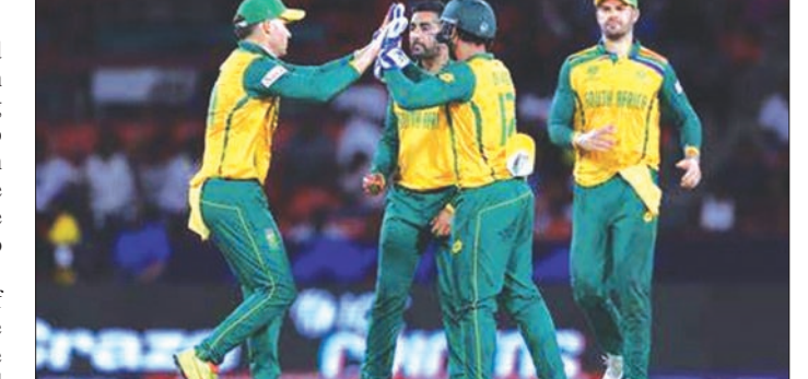
KINGSTOWN (ST VINCENT), June 15: Nepal came within a whisker of achieving its best-ever win in cricket, losing by one run to powerhouse South Africa here.