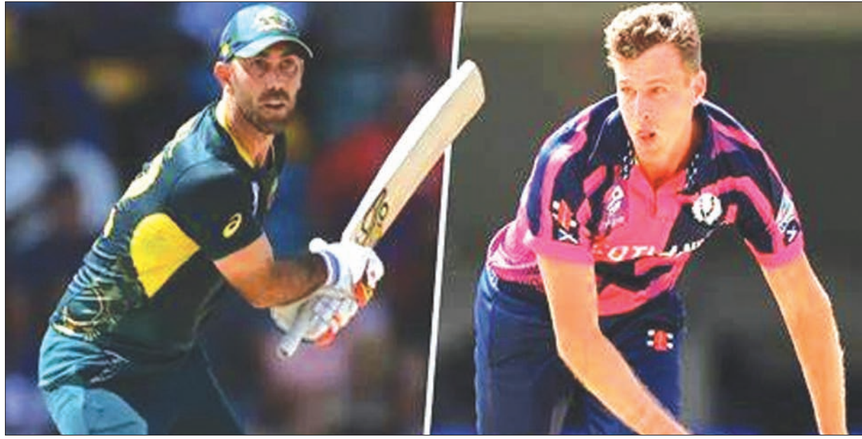
store some pride when they take on a under-firing Ireland in their final Group A match at Lauderhill in Florida on Sunday.

about Australia manipulating their approach against Scotland to keep England threat at bay, but Jos Buttler's team have done themselves a massive favour by improving their Net Run Rate immensely with a dominant victory over Oman.