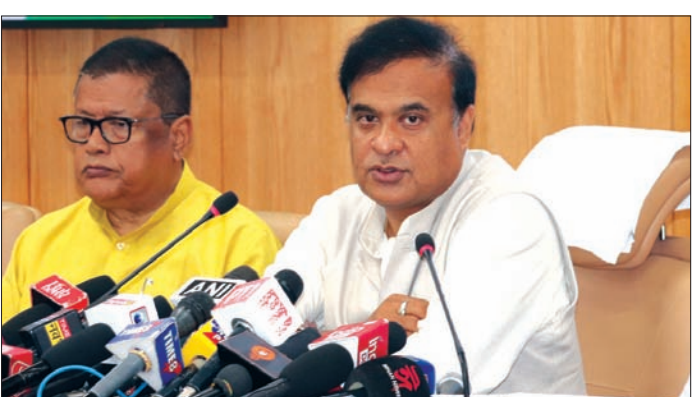
He, however, said that no decision has been taken yet as he has not spoken to the central leadership, which is undergoing a change at present.

GUWAHATI, June 6: Chief Minister Himanta Biswa Sarma on Thursday said he will reshuffle his ministry by including at least three new faces by August 15 in order to create a new team for the 2026 assembly elections. Addressing a press conference here, Sarma said that he has not spoken about it with his central leadership and will consider the process of ministry reshuffle a month after the flood situation in the state is over. "We will change our ministry and a new look will be given to it. We need to prepare the team for 2026 elections that will work with new energy," he added.