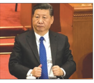
said: "Thank you @ChingteLai for your warm message. I look forward to closer ties as we work towards mutually beneficial economic and technological partnership". Reacting to the messages, Chinese Foreign Ministry spokesperson Mao Ning said China has lodged a protest with India on this. First of all, there is no President in the Taiwan region, Mao said, when asked for her comments at a media briefing here. "On this question, China opposes all forms of official interactions be-

BEIJING, June 6: China on Thursday protested to India over Prime Minister Narendra Modi's social media statement that he looked forward to having closer ties with Taiwan, insisting that New Delhi should resist Taiwan authorities' "political calculations." China views Taiwan as a rebel province that must be reunified with the mainland, even by force. Modi's remarks came in response to a congratulatory message from Taiwan President Lai Ching-te on his election victory. Lai, elected as Taiwan's President last month, in a message posted on X said: "My sincere congratulations to Prime Minister @narendramodi on his election victory. "We look forward to enhancing the fast-growing #Taiwan-India partnership, expanding our collaboration on trade, technology & other sectors to contribute to peace & prosperity in the #IndoPacific," Lai said. In his reply posted on X, Modi