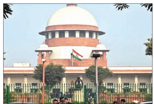
Questioning the claims about leak of question paper on social media platform "Telegram", the bench said, "You have to bear in mind that the idea of somebody doing this was not to make a national charade. People did it for money. So, it was not to bring disrepute to the exam and somebody was doing it to make money which is evident. Mass leakage requires contacts also at that level so that you connect to all such key contacts in different cities." The bench, also comprising Justices JB Pardiwala and Manoj Misra, which commenced the crucial hearing on a batch of petitions related to the controversy-ridden medical entrance exam, said it has "social ramifications". (CONTD. ON PAGE-2)

NEW DELHI, July 18: The Supreme Court on Thursday directed the National Testing Agency (NTA) to declare by 12 noon of July 20 the centre and city-wise results of NEET-UG 2024 while masking the identities of aspirants. As it strove to address the allegations of malpractices in the conduct of the examination, a bench headed by Chief Justice D Y Chandrachud said any order for conducting it afresh has to be on concrete conclusion that the sanctity of the entire process was affected. The top court will resume hearing the arguments on July 22 on a batch of pleas seeking cancellation, re-test and a court-monitored probe into the allegations of large-scale malpractices in the prestigious test held on May 5. During the day-long hearing, the bench asked the counsel for the aspirants to establish their claim about extensive irregularities in holding the examination, including leak of question paper, warranting cancellation and a re-test. The court said it prima facie appeared that the question paper leak was limited to Patna and Hazaribagh, and nothing of this sort can be said to have happened in Godhra in Gujarat. In Patna and Hazaribagh, the question papers allegedly got leaked, while in Godhra there were claims that a person involved in holding the test took money for filling up the OMR sheets of certain candidates.