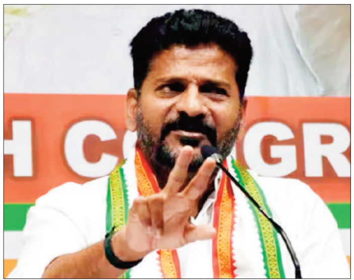
a gathering of farm loan waiver scheme beneficiaries at 'Rythu Vedikas' and Ministers, MLAs and