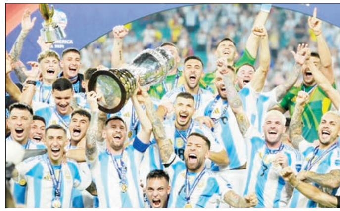
The song refers to France players being "all from Angola," having parents from Nigeria and Cameroon, and also includes an

Villarruel said Argentina's history had been forged by people of all races: "We never forced our way of life on anyone, nor will we tolerate that someone tries to do the same to us."