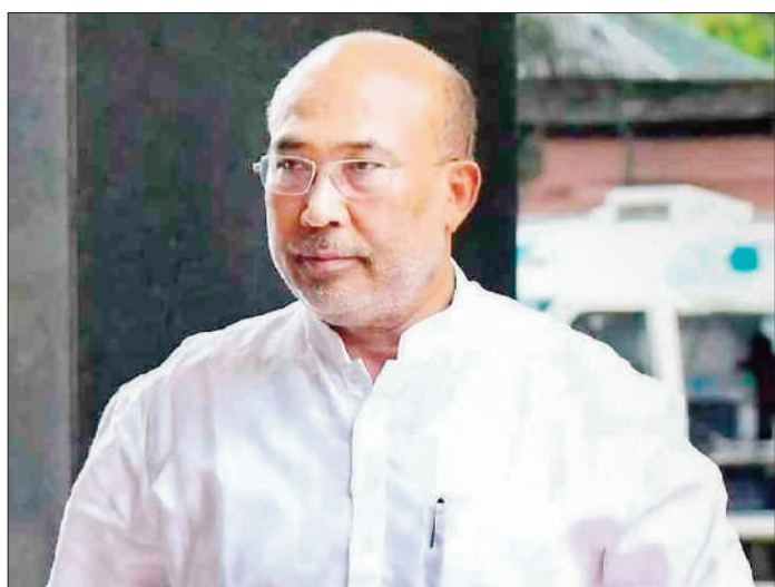
age," Singh posted on Facebook. "During the exercise, 24 (Male-8, Female-16) of Myanmar origin were identified. Further, their bio-

"...a combined team of DC, Tengnoupal led by Md. Ejaj, SDO, Moreh, E-Coy 5 AR, Moreh and OC, Moreh Police Station along with joint bio-metric team of Tengnoupal conducted search of houses in Govajang Village for purpose of re-verification/ re-identification of individuals residing in the vil-