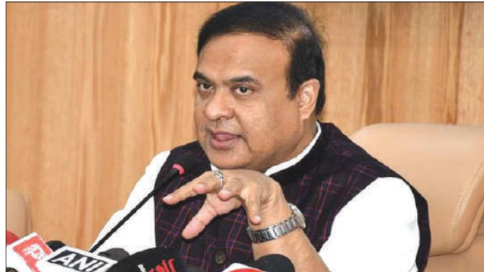
Sarma said the data of the India Child Protection (ICP) report is a "testament to our sustained efforts in empowering Nari Shakti (women power)". As per data from the National Crime Record Bureau and also from a survey covering 1,132 villages in 20 districts of the state, 30 per cent of these areas have reported "complete eradication" of child marriage, while 40 per cent have seen a "significant decline" in the once-rampant practice of the social evil, the report said. The villages surveyed have a total population of 21 lakh, with a child

GUWAHATI, July 18: Chief Minister Himanta Biswa Sarma said his government would continue its crackdown on child marriages and a special drive against the social evil would be conducted every six months. He said the director general of police (DGP) has been instructed to conduct a preliminary survey for the next round of crackdown on child marriages towards the year-end. Sarma's comments come after an NGO report on Wednesday maintained that the state government's action against child marriage has led to a decline in the number of such cases. "Our campaign and tough action against child marriage will continue. Every six months a special drive will be conducted, and the DGP has been instructed to conduct a preliminary survey for the next crackdown on child marriages in November-December this year," the CM said in a video message on Wednesday evening. Initially, some people were "not happy with the crackdown against child marriages, but now people are preventing the social evil, even in minority areas," he said.