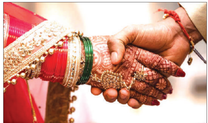
The total number of child marriage cases registered during the last five years was less than the number of girl child marriages taking place in a single day in the

30% of Assam's surveyed villages, child marriage has been eradicated Conviction rate under Child Marriage Act just 11 pc: Report NEW DELHI, July 18: The conviction rate under the Prevention of Child Marriage Act stands at 11 per cent while for all other crimes against children it is 34 per cent, according to a new report. In 2022, out of the total 3,563 child marriage cases listed for trial in courts under the Prohibition of Child Marriage Act, a mere 181 cases were successfully concluded in terms of trial completion. Despite the fact that there are 3,365 cases pending, with the current rate of disposal, the country may take 19 years to clear the backlogs as of 2022, according to a report by the India Child Protection (ICP) research team which was released by child rights body the National Commission for Protection of Child Rights (NCPCR).