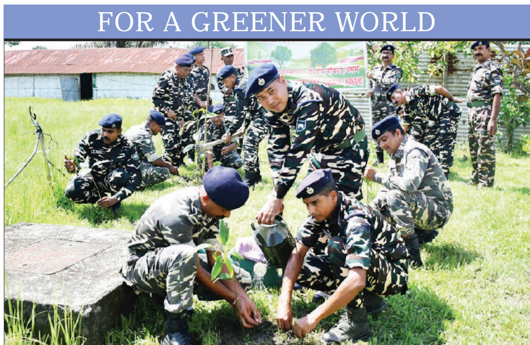
Jawans plant saplings during a plantation drive at SSB camp in Rangiya on Sunday.