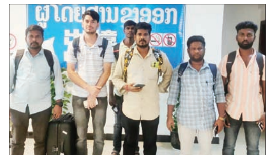
It said agents in places such as Dubai, Bangkok, Singapore and India associated with these firms are recruiting Indians by taking simple interviews and tests. "Victims are illegally taken across the border into Laos from Thailand and held captive to work in Golden Triangle Special Economic Zone in Laos under harsh and restrictive conditions," it said. "At times, they are held hostages by criminal syndicates indulging in illegal (CONTD. ON PAGE-2)

NEW DELHI, July 21: Thirteen Indians, who were lured into certain cyber-scramming centres in Laos, have been rescued and sent back home, the Indian embassy in the Southeast Asian country said on Sunday. "In our continued work to ensure safety & well-being of Indians as top priority, Embassy successfully rescues 13 Indians from cyberscamming centres in Laos & ensures their safe return to India," the mission posted on 'X'. "So far, Embassy has rescued 518 Indians. We thank Lao authorities for their cooperation," it said. On May 7, the embassy came out with an advisory cautioning Indians against fake job offers. "Instances have come to our notice recently wherein Indian nationals are being lured for employment through Thailand," it had said. "These fake jobs are for posts such as of 'Digital Sales and Marketing Executives' or 'Customer Support Service' by dubious companies involved in call-centre scams and crypto-currency fraud in Golden Triangle Special Economic Zone in Laos," the embassy said in the advisory.