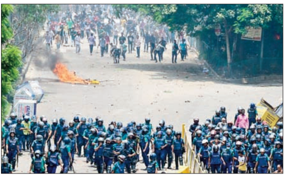
which began on 1 July marched from the Dhaka University campus. The following days the students blocked the Shahbag Square, where historic protests were held and the government accepted the demands in the past.

The apex court on 4 July did not support the High Court verdict that invalidated the 2018 circular on cancellation of quota.