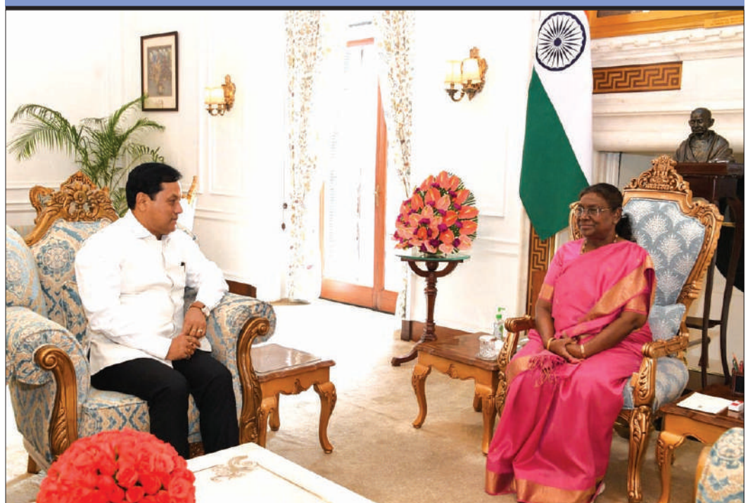
The Union Minister of Ports, Shipping and Waterways, Sarbananda Sonowal paid a courtesy visit to Rashtrapati Bhavan to call on President of India, Droupadi Murmu in New Delhi on Monday.