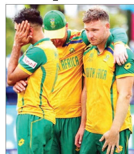
followed by Marco Jansen.

South Africa had looked on course to a memorable win needing 30 runs in as many balls. However, Indian bowlers, led by Jasprit Bumrah, fashioned a remarkable turnaround picking the key wicket of Heinrich Klaasen