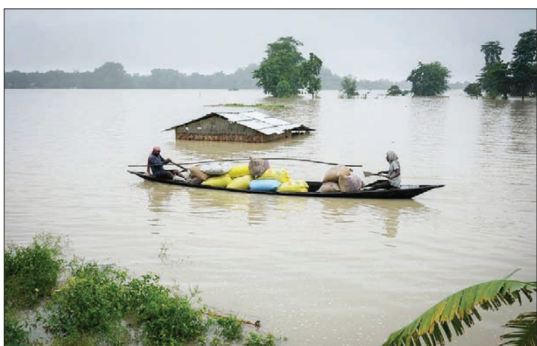
Rescue operations carried out at Dergaon, Khumtai and Bokkhat Revenue Circle by SDRF.

Two persons have been rescued from the breached area at Jagunidhari village but one house fully washed away under Majuli Revenue Circle, a report issued by ASDMA stated.