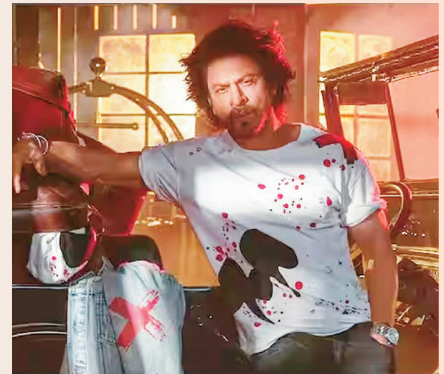
MUMBAI, July 2: Superstar Shah Rukh Khan will be feted with the career achievement honour, at the 77th edition of the Locarno Film Festival, the organisers announced on Tuesday.

He is also the first Indian personality to be honoured with the 'Pardo alla Carriera Ascona-Locarno Tourism'. Italian filmmaker Francesco Rosi, American singer-actor Harry Belafonte, and Malaysian director Tsai Ming-liang are the previous recipients.