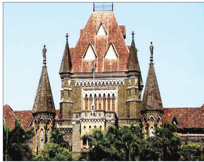
ment's decision to shift the sports complex from Ghansoli in Navi Mumbai to Mangaon.

The order was passed in a public interest litigation filed by the Indian Institute of Architects, Navi Mumbai Centre, challenging the state govern-