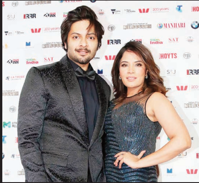
MUMBAI, July 2: Girls Will Be Girls, the debut production of actor couple Richa Chadha and Ali Fazal, has won the Grand Jury Prize at the Indian Film Festival of Los Angeles (IFFLA).