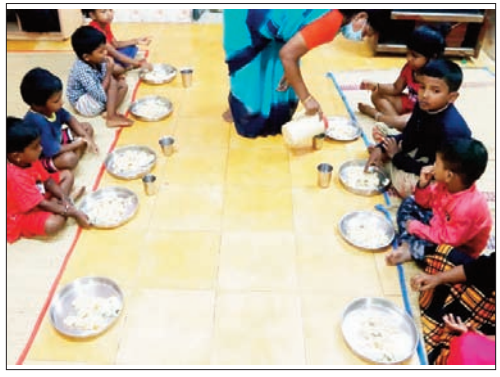
"Children in the age group of six months to three years receive packets of mid-day meal, a pre-mix of dal khichadi, at anganwadis. These packets are distributed to families once they arrive at the anganwadi. On Mon-