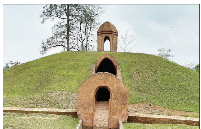
"ICOMOS recommends that India, be inscribed on the World Moidams -- the Mound-Burial Heritage List on the basis of criteria (iii) and (iv)," it said.

The report, which PTI has accessed, evaluated a total of 36 nominations, including 19 new ones, received from across the globe and the Ahom Moidam was the only applicant from India.