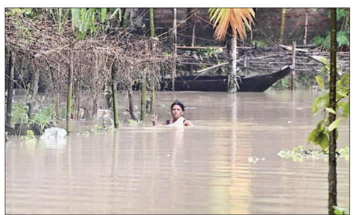
camping in the flood-affected districts for the next three days from Thursday.

The death toll in this year's flood, landslide and storm has increased to 56 and three others are reported missing.