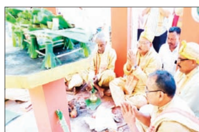
inclusion in the UNESCO World Heritage List for the year 2023-24.

The state government had submitted a dossier to the Prime Minister in 2023 and he selected it among a list of monuments for submission as India's nomination for