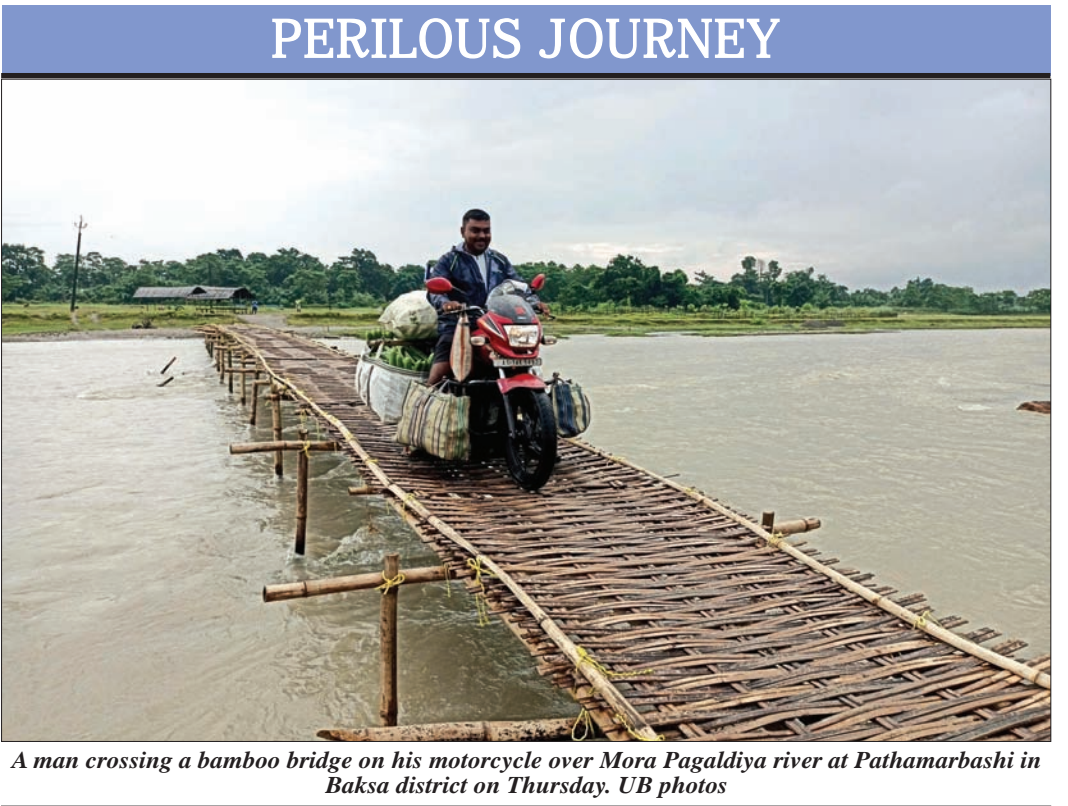
A man crossing a bamboo bridge on his motorcycle over Mora Pagaldiya river at Pathamarbashi in Baksa district on Thursday.