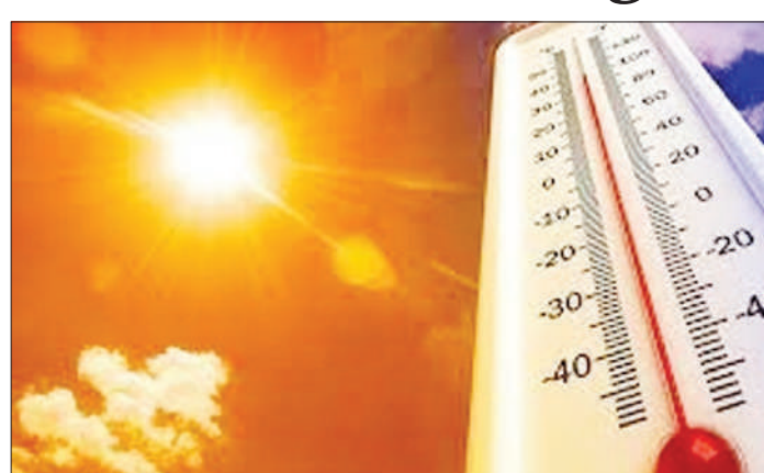
average. At the 2015 UN climate talks in Paris, world leaders committed to limiting the global average temperature rise to 1.5 degrees Celsius above the pre-industrial period to avoid the worst impacts of climate change. However, a permanent breach of the 1.5-degree Celsius limit specified in the Paris Agreement refers to long-term warming over a 20 or 30-year period. Earth's global surface temperature has already increased by around 1.2 degrees Celsius compared to the average in 1850-1900 due to the rapidly-increasing concentration of greenhouse gases -- primarily carbon dioxide and methane -- in the atmosphere. This warming is considered to be the reason behind record droughts, wildfires and floods worldwide. According to new data, June 2024 was the warmest on record, with an average surface air temperature of 16.66 degrees Celsius, 0.67 degrees Celsius above the 1991-2020 average for the month and 0.14 degrees Celsius above the previous high set in June 2023. "The month was 1.5 degrees Celsius above the estimated June average for 1850-1900, the designated pre-industrial reference period, making (CONTD. ON PAGE-2)

NEW DELHI, July 8: With millions of people across five continents experiencing scorching heat last month, the European Union's (EU) climate agency, Copernicus Climate Change Service (C3S), confirmed on Monday that June was the warmest on record. It also marked the 12th consecutive month of global temperatures reaching 1.5 degrees Celsius above the pre-industrial average. According to scientists at C3S, every month since June last year has been the warmest such month on record. In January, the world completed an entire year with the mean surface air temperature exceeding the 1.5-degree Celsius threshold. June was the 12th consecutive month with monthly average temperatures above the 1850-1900 pre-industrial