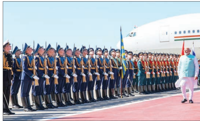
President Xi Jinping during his visit to Russia as well. On Tuesday, Modi will co-chair the 22nd India-Russia annual summit with president Putin, interact with the members of the Indian community and visit the Rosatom pavilion at an exhibition. The prime minister is also scheduled to lay a wreath at the 'Tomb of the Unknown Soldier'.

MOSCOW, July 8: In his first trip since the start of Moscow's invasion of Ukraine, Prime Minister Narendra Modi on Monday travelled to Russia to hold summit talks with President Vladimir Putin -- a visit that is being seen as having a wider geopolitical context and signalling. Shortly after landing in Moscow, Modi said he is looking forward to deepening bilateral partnership in futuristic areas and that stronger ties between India and Russia will "greatly benefit our people".