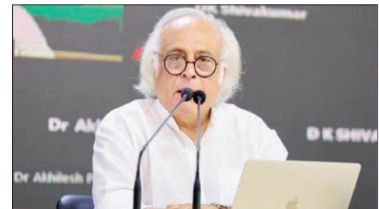
NEW DELHI, July 8: Accusing the Modi government of practising "cronyism", the Congress on Monday said companies must expand but at the same time, the government has a responsibility to ensure oligopolies or monopolies do not emerge and that undue advantage arising out of access to political power is not exercised.

Congress general secretary, in-charge communications, Jairam Ramesh alleged that market concentration continues to grow under Prime Minister Modi's watch, and has reached a new high in key industries such as telecom, airlines, cement, steel, and tyres. He also shared on X a media report which claimed market concentration continued to increase in India's key industries as top players grabbed a larger share of the business in 2023-24 either through organic growth or acquisition. In his post on X, Ramesh said, "Cronyism is the non-biological Prime Minister's primary economic policy. Market concentration continues to grow under Mr. Modi's watch, and has reached a new high in key industries such as telecom, airlines, cement, steel, and tyres." "Revenue share of the top two firms has risen across industries in the last two years. Most industries in India are either moderately or (CONTD. ON PAGE-2)