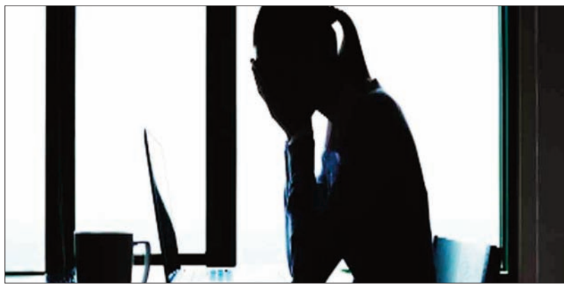
By: Jyoti Saikia

In today's digital era, the internet serves as a vital resource for communication, education, and empowerment. Yet, for many women, it also presents significant risks, as cyber harassment and online abuse have become pervasive threats. In India, the rapid growth of digital platforms has unfortunately coincided with a troubling rise in gender-based violence online.