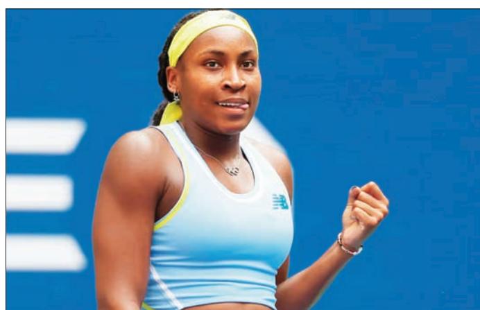
day's schedule: The night session in Ashe began with 2017 winner Sloane Stephens blowing a huge lead against Clara

can — but not the expectation that I should." Day 1 at the year's last Grand Slam tournament went about as well as possible for Gauff and another young American featured in Ashe, 13th-seeded Ben Shelton, a semifinalist a year ago who beat 2020 champion Dominic Thiem 6-4, 6-2, 6-2. It was the last U.S. Open match for Thiem, who turns 31 next week and is retiring after this season. "Obviously she plays with a lot of passion," Shelton, 21, said about Gauff. "You could tell that she cares out there. She's into it every time that she's on the court. I think that's something that the people love." Gauff was not the only past U.S. Open champ on Mon-