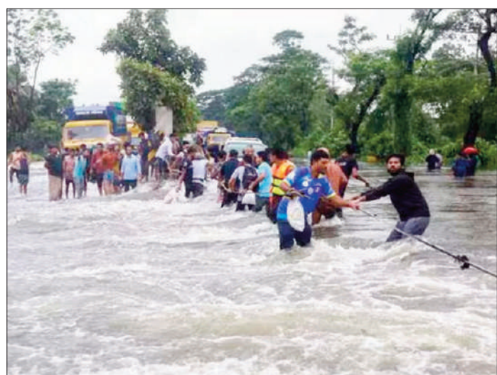
Saha also expressed gratitude to Madhya Pradesh CM Mohan Yadav and UP CM Yogi Adityanath for extending financial support to the state.

He said the state government will present a "true picture of devastation" caused by the floods when the central team arrives.