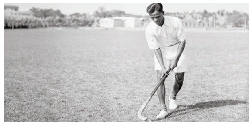
ian honor, in 1956.

After retiring from active play, Chand continued to contribute to Indian hockey as a coach. He served as the Chief Hockey Coach at the National Institute of Sports, Patiala from 1961 to 1969. The Government of India recognized his immense contribution to Indian sports by awarding him the Padma Bhushan, India's third-highest civil-