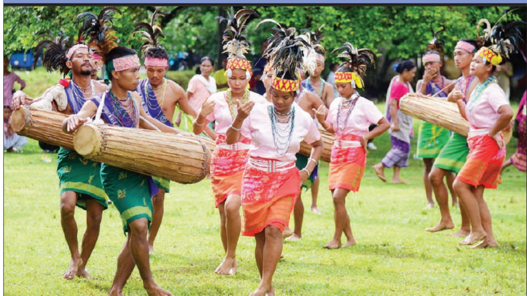
Garo tribal boys and girls perform their traditional Wangala dance during the 108th death anniversary commemoration of PA Sonaram R Sangma, at Bakrapur village, Dudhnoi in Goalpara on Wednesday.