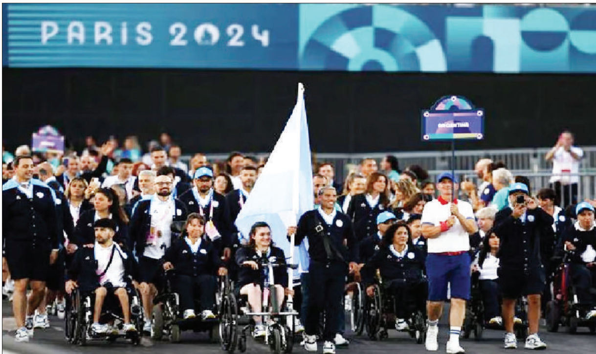
the delegations entered the square in alphabetical order.

The opening ceremony was held outside the confines of a stadium, just like when the Olympics opened in the city on July 26. Fighter planes flew overhead, leaving red-white-and blue vapors in the colors of the French national flag, before