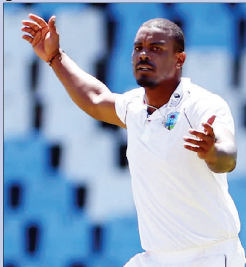
Test tour to Bangladesh, February's T20 series at home against Australia, along with the recent ICC T20 World Cup in the USA and West Indies," said New Zealand Cricket

"The 229-capped international officially joins the Blackcaps staff after supporting the team as bowling coach in last year's