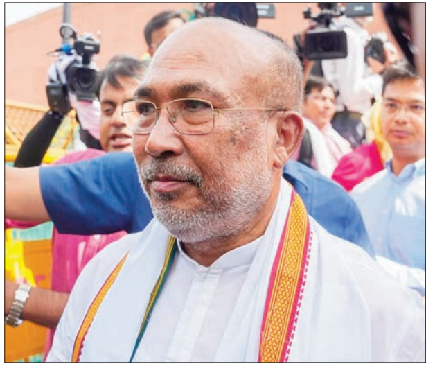
protests first started in mid-July. The chief minister was speaking at a function to mark the Centre's 'Har Ghar Tiranga' initiative.

Over 230 people were killed in Bangladesh in the incidents of violence that erupted across the country following the fall of the Hasina government on Monday, taking the death toll to 560 since the anti-quota