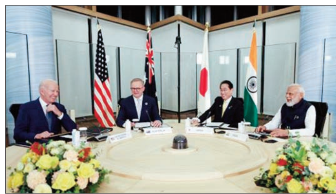
country by name.

In a joint statement after the summit, the leaders of the Quad countries said that they are "seriously concerned" about China's escalations in the South China Sea, without naming the