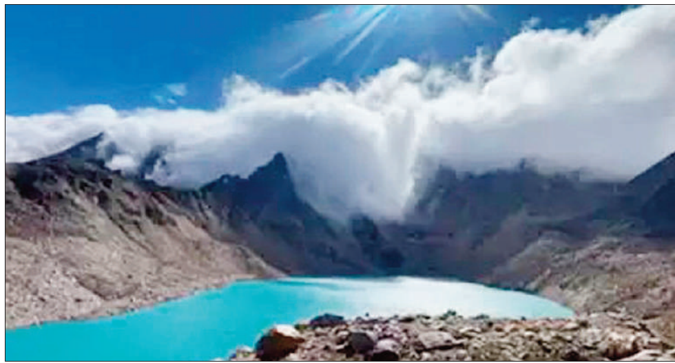
The Chief Minister expressed gratitude to the Centre for providing budget allocations to implement GLOF prevention measures.

He also mentioned plans to visit affected areas towards the end of the year to gain a comprehensive on-the-ground perspective.