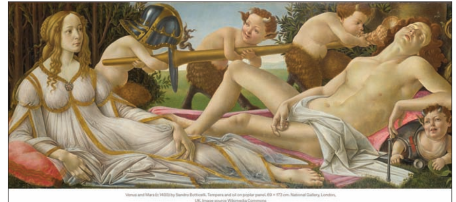
By: Shashanka Das

Page 5 Oct 20_Normal Pages 19-10-2024 19:30 Page 1