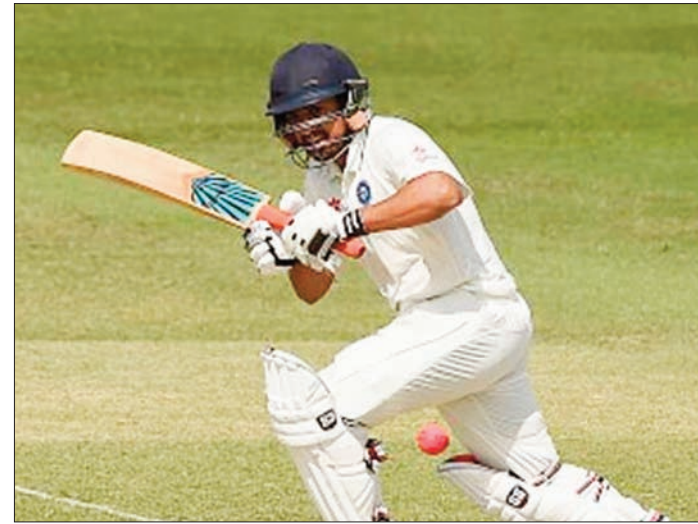
Test debut series against England earlier this year, roared back to form with a sensational 102-ball 159, yet Madhya Pradesh had to settle for a draw against Haryana.