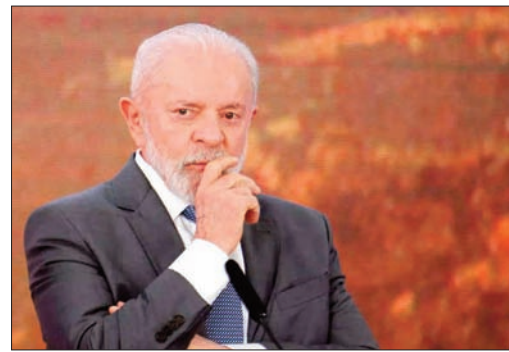
BEIJING, Oct 29: In a major setback to China's BRI, Brazil has decided against joining Beijing's multi-billion-dollar initiative becoming the second country after India in the BRICS bloc not to endorse the mega project. Brazil, headed by President Lula da Silva, will not join the Belt and Road Initiative (BRI) and instead seek alternative ways to collaborate with Chinese investors, Celso Amorim, special presidential adviser for international affairs, said on Monday.

Brazil wants to "take the relationship with China to a new level, without having to sign an accession contract", he told Brazilian newspaper O Globo.