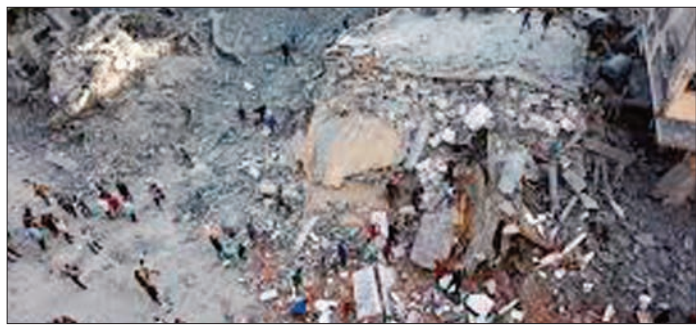
A photograph showing the aftermath of a strike in Gaza, with rubble and debris scattered on the ground.

DEIR AL-BALAH (GAZA STRIP), Oct 29: An Israeli strike on a five-story building where displaced Palestinians were sheltering in the northern Gaza Strip killed at least 60 people early on Tuesday, more than half of them women and children, Gaza's Health Ministry said.