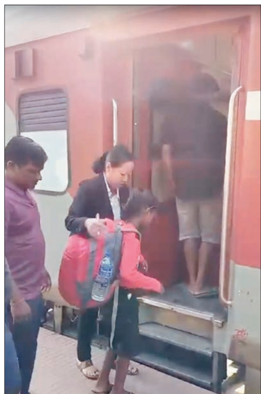
Image showing a train at a station platform with passengers and staff.