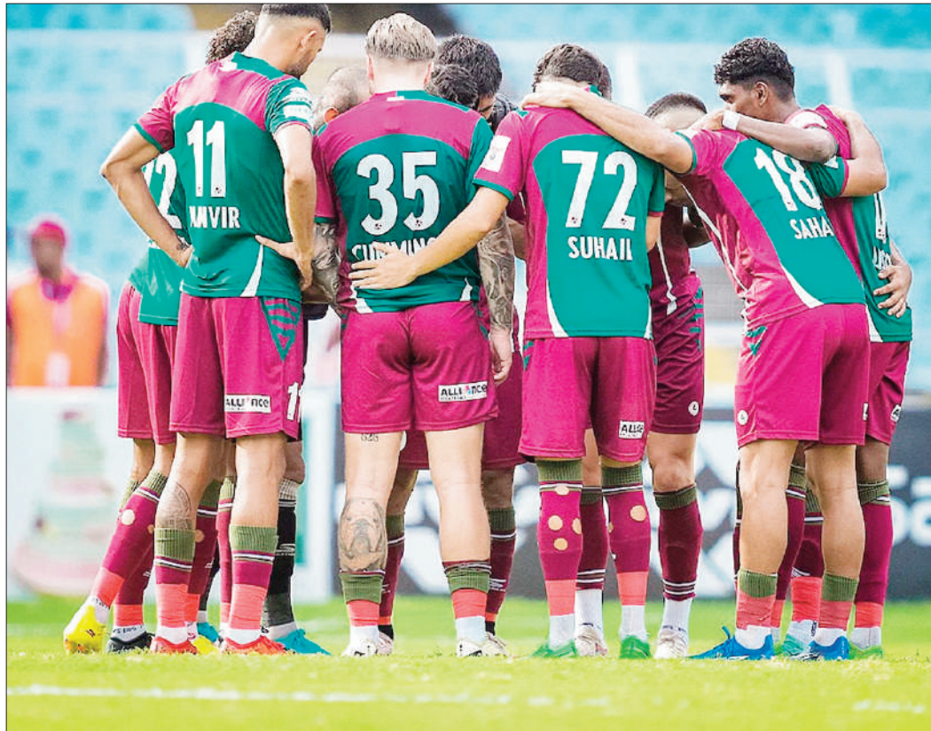
clean sheet in six encounters. The Mariners beat Hyderabad FC in both their fixtures last season. However, a revived home team setup might present a tougher challenge to the Kolkata-based team. Mohun Bagan Super Giant

The defending ISL champions have won four times and drawn twice in the period, keeping a