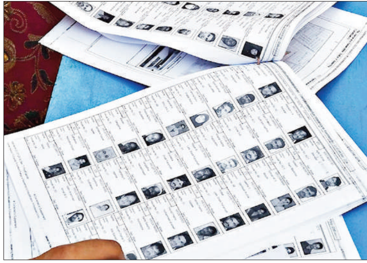
Image showing a draft electoral roll document with columns for names and addresses.