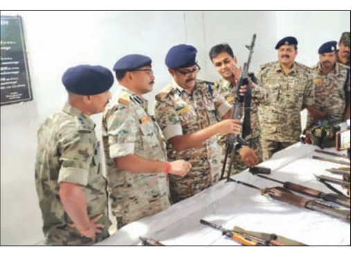
ing Dantewada and Narayanpur, so far this year, police said. On April 16, as many as 29 Naxalites, including some higher-ranking cadres, were killed in an encounter with security personnel in Kanker district. Meanwhile, Union home minister Amit Shah during his review meeting of the inter-state coordination committee in Raipur in August this year declared that the country will be free from the Maoist menace by March 2026.