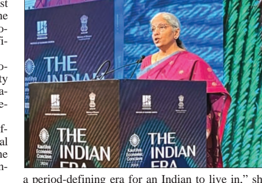
a period-defining era for an Indian to live in," she added. The Indian government, she said, will try to double the per capita income in a matter of a few years for its 1.4 billion strong population (which makes up 18 per cent of the global total) notwithstanding the geopolitical challenges threatening world peace. By 2047, as India crosses the 100-year mark of independence, she said, the new Indian era will have core characteristics similar to developed countries. The Viksit Bharat will usher prosperity not just to

NEW DELHI, Oct 4: India will witness the steepest rise in living standards of the common man on the back of the government's initiatives and the efforts towards doubling per capita income in a few years, finance minister Nirmala Sitharaman said on Friday. Addressing the 3rd edition of the Kautilya Economic Conclave, the minister stressed that inequality in India has declined with the Gini coefficient, a statistical tool to measure inequality, showing improvement in urban as well as rural areas. "I expect these improvements to continue as the effects of the last ten years of economic and structural reforms manifest more thoroughly in the data in the coming years as the Covid shock fades from the economy," Sitharaman said. "The upcoming decades, the minister said, "will see the steepest rise in living standards for the common man, truly making it a period-defining era for an Indian to live in." "While it took us 75 years to reach a per capita income of USD 2,730, as per IMF projections, it will take only five years to add another USD 2,000," she mentioned. "The upcoming decades will see the steepest rise in living standards for the common man, truly making it