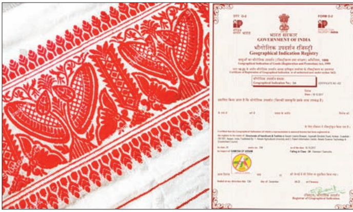
By: Himangshu Ranjan Bhuyan

The Gamosa is not merely a textile; it embodies the very essence of Assamese culture and identity. Recognized for its unique design and rich symbolism, the Gamosa has become a cherished artifact of Assam, deeply woven into the daily lives and rituals of its people. In 2022, the awarding of the Geographical Indication (GI) tag to the Gamosa marked a significant milestone in preserving its authenticity and cultural heritage. This article explores the multifaceted significance of the Gamosa, the implications of its GI tag, and the challenges and opportunities that lie ahead for this iconic symbol of Assamese pride.