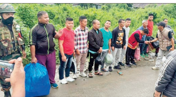
IMPHAL, Oct 3: Eleven Kuki-Zo inmates from Sajiwa Central Jail in Imphal were sent to Kangpokpi district on Thursday morning, days after being granted bail by a court, officials said.

"The inmates, who had been incarcerated for various offences, including drug-related charges, were recently granted bail by a local court," an official said, noting that their release had been delayed due to the prevailing situation in the state.