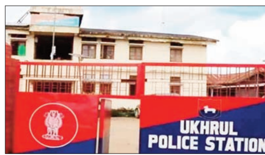
IMPHAL, Oct 3: A mob stormed a police station in Manipur's Ukhrul town and looted arms during a clash between two groups, officials said on Thursday.

Three persons were killed and 20 others injured in a gunfight that broke out between two groups on Wednesday over cleaning a disputed land in the town as part of 'Swachhata Abhyan'.