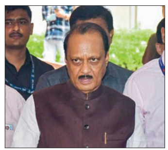
Deputy Chief Minister Ajit Pawar speaking at a press conference.

"I am the Finance Minister of the state. I can confirm that our annual revenue stands at around ₹ 42-43 lakh crore. We are adhering to the fiscal framework designed for the state by the Centre, and we have not exceeded those calculations. I have handled the finance