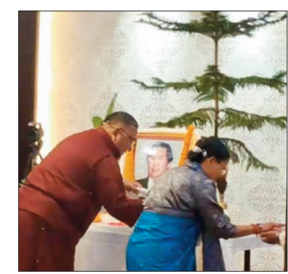
Chief Minister Prem Singh Tamang paying tribute to Nar Bahadur Bhandari.

GANGTOK, Oct 5: The 84th birth anniversary of Sikkim's second chief minister Nar Bahadur Bhandari was observed across the Himalayan state on Saturday with fanfare. Chief minister Prem Singh Tamang paid tributes to Bhandari on the occasion. "By commemorating 'Shri Bhandari Jayanti', we honour the legacy of the 'Architect of Modern Sikkim', a visionary leader whose enduring contributions have profoundly shaped the destiny of our state," the CM said in a social media post. The Sikkim Krantikari Morcha (SKM) government resolves to remain steadfast in its pledge to follow the path and unwavering dedication shown by the