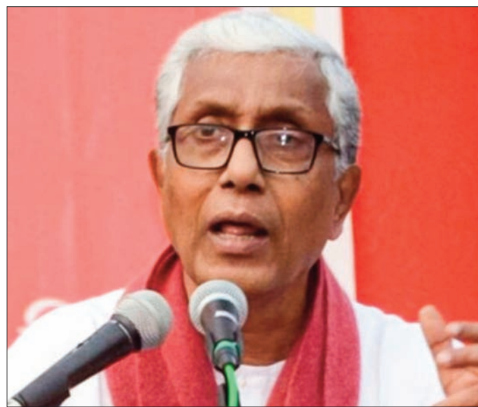
Manik Sarkar speaking at a podium during a rally.