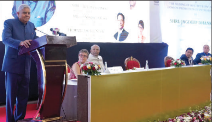
foundation stone laying ceremony of Meghalaya Skill and Innovation Hub At Shillong today, the Vice-President highlighted that skill is neither discovered nor innovated, it is in fact the optimal exploitation of talent of a person in that specified field which gives the human resource a qualitative cutting-edge. He underscored that skilling is no longer a quality, it is our need.

SHILLONG, Oct 16: The Vice-President Jagdeep Dhankhar has said that "North-East is on the radar of nation's development." He emphasized that the North-East is a significant contributor to unity, economic progress and cultural essence of the nation.