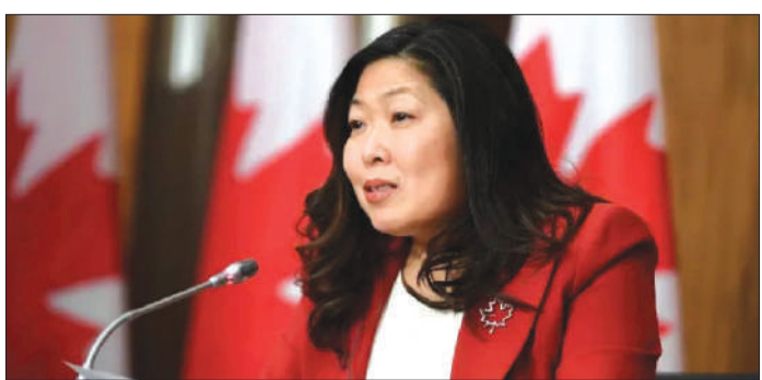
mercial ties between Canada and India," Mary Ng, the minister of export promotion, international trade and economic development, said in a statement.

WASHINGTON, Oct 16: Amidst an unprecedented diplomatic row between India and Canada, the Canadian trade minister has assured the country's business community that they are committed to supporting the well-established commercial ties between the two countries. Mary Ng, minister of export promotion, international trade and economic development, made these remarks on Tuesday as tensions between India and Canada escalated after Canadian Prime Minister Justin Trudeau on Monday accused the Indian government of supporting criminal activities targeting Canadian citizens. India on Monday expelled six Canadian diplomats and withdrew its high commissioner and five other diplomats from Ottawa. Canada, however, said the Indian diplomats were expelled. Ng also said that "the Government of Canada remains open to a dialogue with India and we look forward to continuing our valued relationship." "I want to reassure our business community that our government remains fully committed to supporting the well-established com-