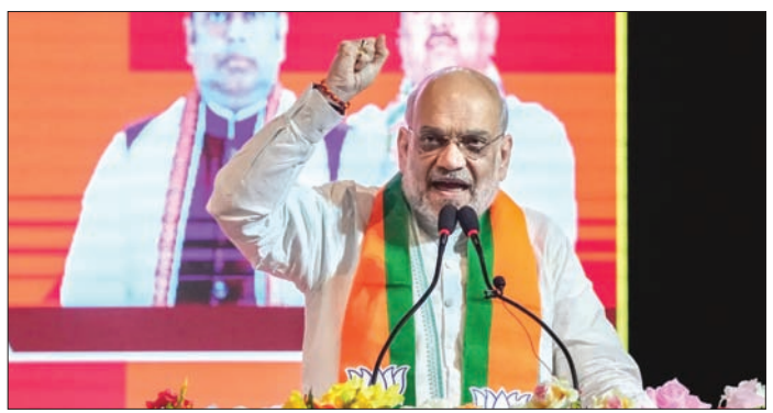
Union Home Minister Amit Shah during a press conference.

KOLKATA, Oct 27: Union Home Minister Amit Shah on Sunday accused the TMC government in West Bengal of aiding "state-sponsored infiltration" and corruption, claiming that incidents of assault on women in Sandeshkhali and the rape and murder of a doctor at RG Kar Hospital are evidence that women are "not safe" in the state.