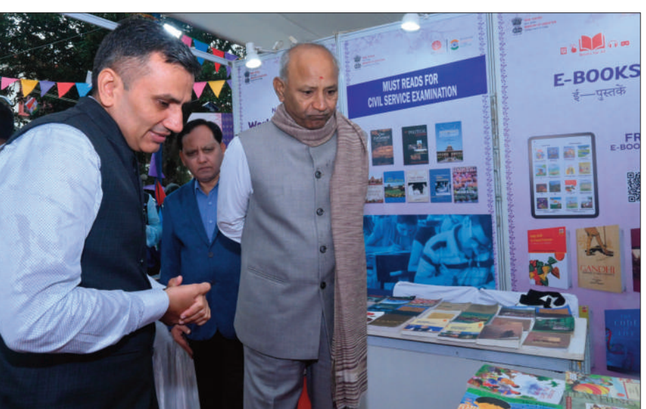
2nd edition of Shillong Book Fair, organised by the National Book Trust, India (under the Ministry of education, Government of India) being inaugurated by the Governor of Meghalaya, CH Vijayashankar.

Their suggestions ranged from prioritizing vulnerable sections within the Khasi, Jaintia, and Garo communities to proposing different distribution models of job reservation within these