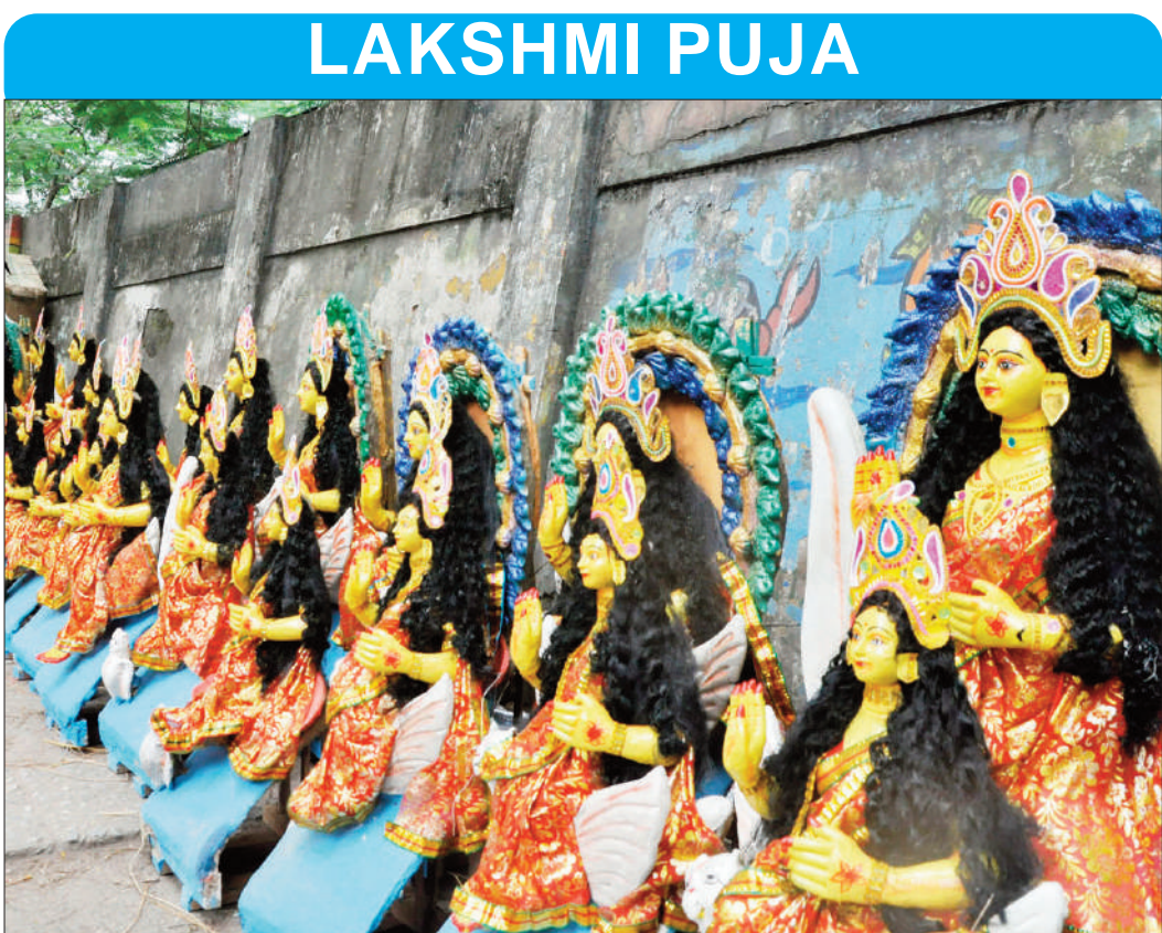
Idols of Goddess Lakshmi on display in the streets of Ganeshguri on Tuesday.