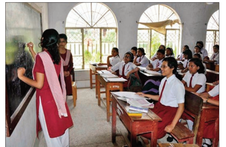
state and identity by it's self", the TISF demands. They have also demanded to the Governor in making of proper Scholl by providing the student good Infrastructures in every schools and education institutions by providing good sitting arrangements, water connectivity, proper restrooms especially for girls, proper Class rooms and every single needs the students are de-

for every single student where belongings from any religion, community, caste and tribe can join and can earn the same knowledge under a roof of institutions", the memorandum reads. It said that after visiting every colleges and most of the schools there are not a single room arrangements of the study materials which are the main source of the students, no proper rest rooms for girls and boys, no proper drinking water managements the basic needs of human beings, as same no proper sitting arrangements and schools without proper needs of electricity, without proper education facilities if we say in a single word. "Establishment of libraries in every schools where the students basic needs may get relief in a large number. We strongly demand for the compulsory traditional Dress code (RIGNAI) for every school, college's and education institutions at least twice in a week. "RIGNAI" attire known as identity of our state and our rich custom from so long reflects our