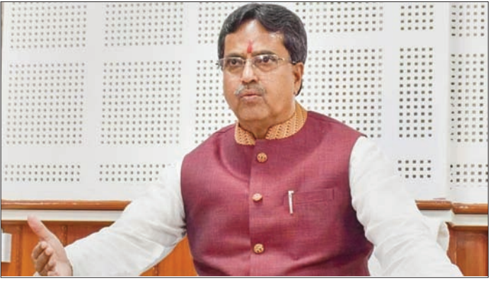
Agartala on the occasion of Bhai Phonta on Sunday. The chief minister expressed that sisters from various parts of the state came to his official residence today and

AGARTALA, Nov 3: Chief minister Manik Saha said on Sunday that the state government has undertaken various important schemes for the welfare of women, and additionally, the current state government is giving special attention to the safety of women in line with 'Ek Tripura, Shrestha Tripura' vision. "We all have to unite to build an Ek Tripura, Shrestha Tripura. The state government has initiated various important schemes for the welfare of women, and besides this, the present state government is prioritizing women's protection," said Dr. Saha. Dr. Saha said this during a function held at his official residence in