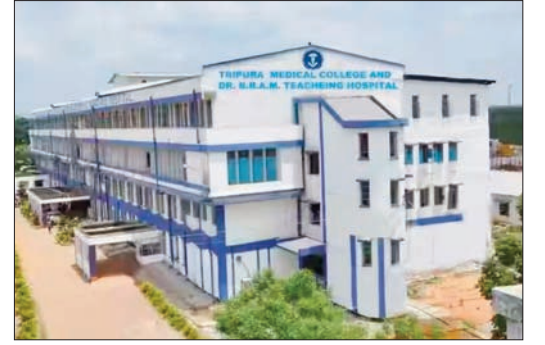
le. It is not clear from the newspaper report as to whether action has been taken or not in terms of the State enactment. Any leniency in taking action in terms of the provisions would encourage such anti-social activities in the educational institutions", the report said. The Commission further directed the Principal, Tripura Medical College and Hospital to submit a detailed report about the incident within 3(three) weeks. "The Commission also thought it appropriate to have an independent inquiry by the District Magistrate, West Tripura in respect of the incident and get a report within 3(three) weeks. The Superintendent of Police, West Tripura also should inquire into the matter and submit a report within 3(three) weeks. Send a copy of this order along with a copy of the news item to the authorities for submission of reports", the order said.