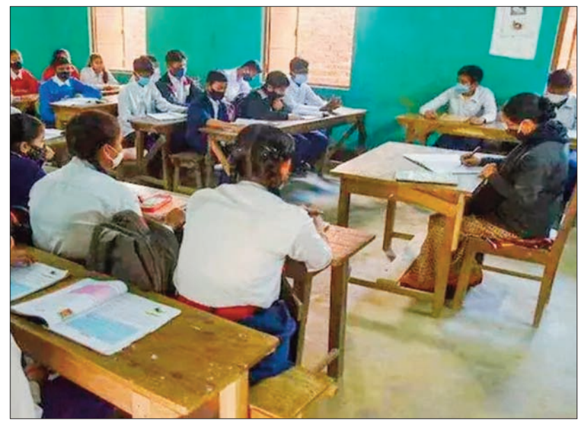
first day of class for students," he said. Earlier, Vidya Pravesh was evaluated by an NCERT team in June this year. "In the first phase of review, officials not only evaluated the students, but also interacted with teachers and parents regarding the pros and cons of the project," he said. "The NCERT team was very pleased