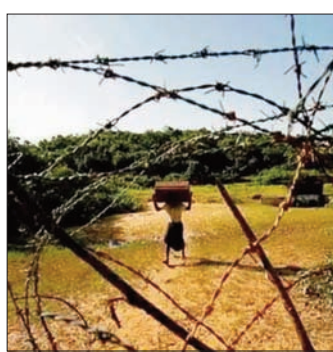
zen wandering in the Aralia area of Sonamura. Acting on the tip, the police began patrolling the area.

The RNSOM and the RNYOM then said they will fully support any action as and when the apex Naga body initiated in the larger interest of Naga public. (NNN)