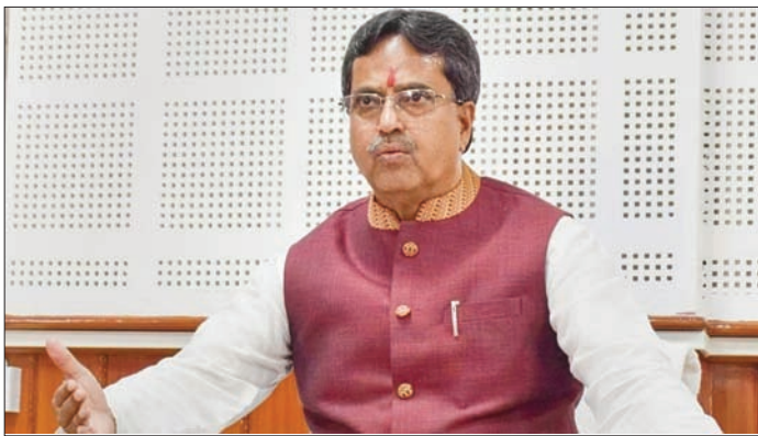
Agartala on the occasion of Bhai Phonta on Sunday. The chief minister expressed that sisters from various parts of the state came to his official residence today and sought blessings for him.

Dr. Saha said this during a function held at his official residence in