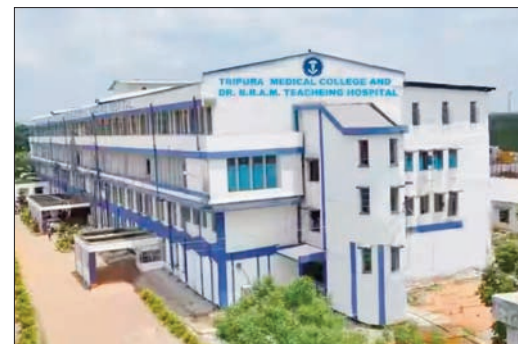
It is not clear from the newspaper report as to whether action has been taken or not in terms of the State enactment. Any leniency in taking action in terms of the provisions would encourage such anti-social activities in the educational institutions”, the report said.

It is also reported that the College authority has failed to prevent and/or stop the ragging, which has polluted the learning atmosphere of the Medical Col-