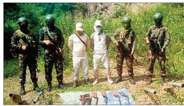
possession during their arrest on Friday.

A hand grenade, five demand letters of the outfit, five mobile handsets, 13 SIM cards and a four-wheeler were seized from their