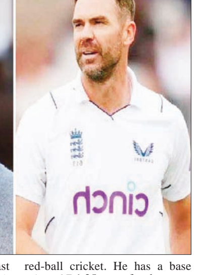
auction. Asked about the decision, the