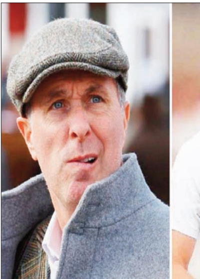
The veteran pacer, who last played a T20 10 years ago in 2014, has never competed in a global franchise T20 league, prioritising