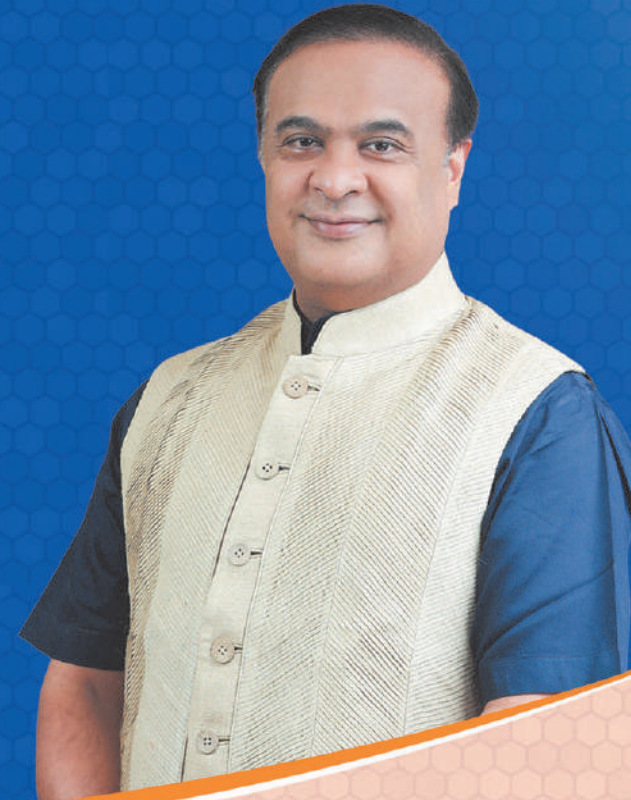
Dr Himanta Biswa Sarma Chief Minister, Assam

Providing free education to BPL students of Class XI and XII in Government and Provincialised Secondary Schools of Assam