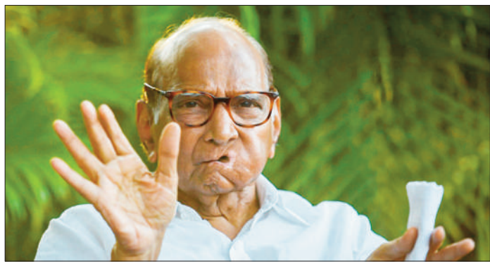
Deputy Chief Minister Ajit Pawar.

The four-term former Maharashtra chief minister and ex-Union minister was blistering in his criticism of Uttar Pradesh Chief Minister Yogi Adityanath, whose "batangain to katangain" slogan has drawn criticism from even some BJP leaders and allies like