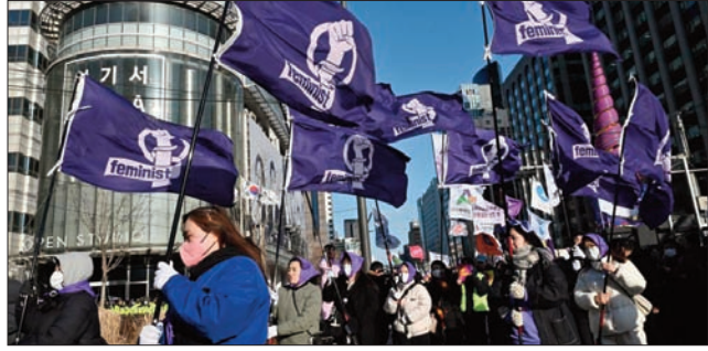
By: Ming Gao

In South Korea, a growing number of young women are rejecting societal expectations of marriage, motherhood and heterosexual relationships, known as the "4B Movement" or the "4 Nos".