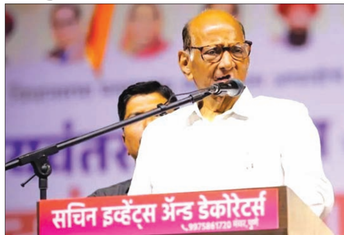
regime in Maharashtra).

...tion stop? Official bungalows near the state secretariat have become facilitation centres for corruption," he alleged. He accused the rulers (BJP, Shiv Sena, and NCP headed by his nephew Ajit Pawar) of being involved in communal and caste politics while the law and order situation is in dire straits, unemployment rising, and farm distress growing due to the lack of adequate price for crops. "Maharashtra is a cultured, progressive, strong and self-respecting state. It didn't just show the path to the nation but stood by it during crises. However, incumbent rulers have become pawns in the hands of Delhi," Pawar said. He accused Mahayuti leaders of being "hell-bent" on insulting state's icons like Chhatrapati Shivaji Maharaj, whose statue collapsed in August this year, and Jyotiba Phule and Savitribai Phule. "A person holding a Constitutional post made derogatory comments on the married life of Savitribai and Jyotiba Phule. The corruption caused the collapse of the statue of Shivaji Maharaj (in coastal Sindhudurg district)," Pawar said. Speaking to reporters at Satara, the former chief minister said the people would ensure change (of