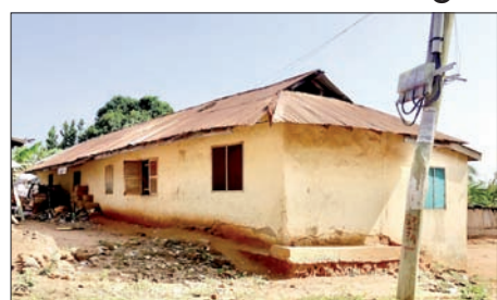
day, the panel said the "Housing for All" vision might not achieve its target until the beneficiaries were provided "proper hand-holding" in

In a report tabled in the Lok Sabha on Thurs-