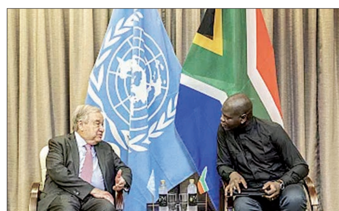
Countries adopted an agreement at the UN climate talks in Azerbaijan last month to inject at least USD300 billion a year to help developing nations cope with global warming. It was far short of the more than USD1 trillion developing countries were calling for.

A focus of Guterres' visit has been the money-poor nations in Africa and elsewhere need to deal with the impact of a warming planet. While Africa contributes a tiny amount to global warming, it is one of the worst affected continents.