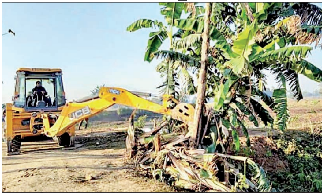
"Where will the people live now?" he asked.

Another senior resident said that the administration failed to make any alternative arrangements for them.