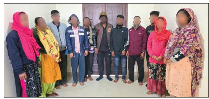
South Salmara Mankachar dist border, where they were held. "No place for illegal infiltration in Assam, carrying out their strict monitoring against infiltration attempts. @assampolice apprehended 6 Bangladeshis nationals and pushed them across the border," the chief minister posted on X. Earlier in the day, six Bangladeshis have been apprehended by the Assam Police for entering the Indian territory illegally and handed over to the authorities of the neighbouring country, Sarma said. He, however, did not mention the sector of the India-Bangladesh

GUWAHATI, Dec 23: Twenty two Bangladeshis, including five children have been apprehended by Assam Police in two different operations for entering Indian territory illegally, Chief Minister Himanta Biswa Sarma said on Monday. Sixteen Bangladeshis were apprehended in inter-state movement after arriving at Guwahati railway station from Bengaluru, they were moving towards South Salmara district, he said. The nationality of the apprehended was established to be Bangladeshis on investigation, he added. "The apprehended include seven male, four female, and five children and these people are being pushed back across the border," he said. "Inter-state movement of infiltrators busted; 16 Bangladeshis nabbed. In an excellent op carried out by @SSalmaraPolice, 16 illegal Bangladeshis who travelled from Bengaluru to Guwahati Railway Station and moved towards