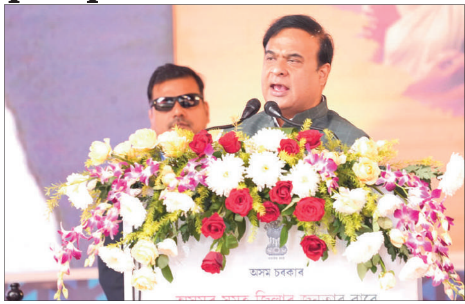
government schemes," the post read. Grants and benefits under initiatives by the education, finance, revenue, disaster management, and industries and commerce departments were distributed. These included 2,593 students receiving

DIBRUGARH, Dec 23: Nearly 32 lakh people received benefits under various schemes during a special initiative by the Assam government which concluded on Monday, Chief Minister Himanta Biswa Sarma said. The '12 Days of Development' campaign reached out to both the poor and middle-class sections of the state, he added. "We had started this campaign in Guwahati, and after 12 days, we are concluding it in Dibrugarh today," Sarma told reporters after attending a meeting. During the campaign, 20 lakh new ration cards were distributed, assistance was provided to six lakh flood-hit people, and meritorious students received scooters, bicycles, and other incentives under various schemes, the CM said. "About 30-32 lakh people have received benefits under government schemes during this period. We are confident that these schemes will help the poor and middle-class sections of the population," Sarma said. The chief minister's office (CMO), in a post on X, mentioned that grants and facilities under different departments were distributed by Sarma during the day. "On the final day of the #12DaysOfDevelopment campaign, HCM Dr. @himantabiswa attended an event at Mancotta Ground, Dibrugarh, to distribute benefits under various