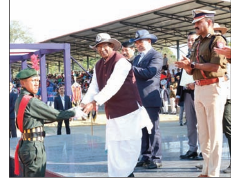
The intensive 44-week basic training course for 1,984 Manipur Police recruits commenced at the Assam Police Academy here in January. Acharya congratulated the newly trained constables, stating, "Today marks a momentous occasion in your lives. You have successfully

HT Bureau GUWAHATI, Dec 23: The Governor of Assam and Manipur, Lakshman Prasad Acharya said that the security challenges in the Northeast go much beyond the threat emanating from conventional borders and conventional crimes. Attending the passing out parade ceremony of 1946 newly recruited constables of Manipur Police at Lachit Barphukan Police Academy, Dergaon on Monday, Acharya said the contemporary problems demand capable and responsive police forces to ensure stability and peace, for the region to tread the path of progress and prosperity. "The 21st Century has ushered in its own set of challenges. Though turbulence and uncertainty have manifested all along the history of mankind, this century has witnessed challenges emanating from digital proliferation," Acharya said. He, thereby, asked the police forces to equip themselves with the art of policing required to deal with the challenges of the 21st century.